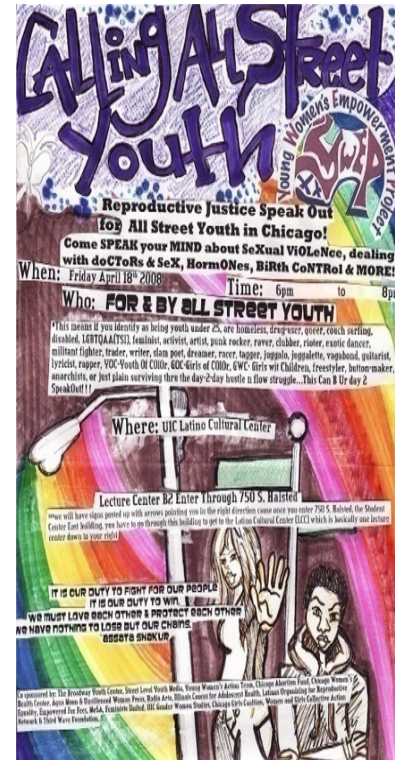
YWEP (Young Women's Empowerment Project)

Get familiar with the way you smell and the color of your vagina so that you can catch signs of infection quicker. An acidic smell is normal. If your smell is stronger than usual, you might have an infection.