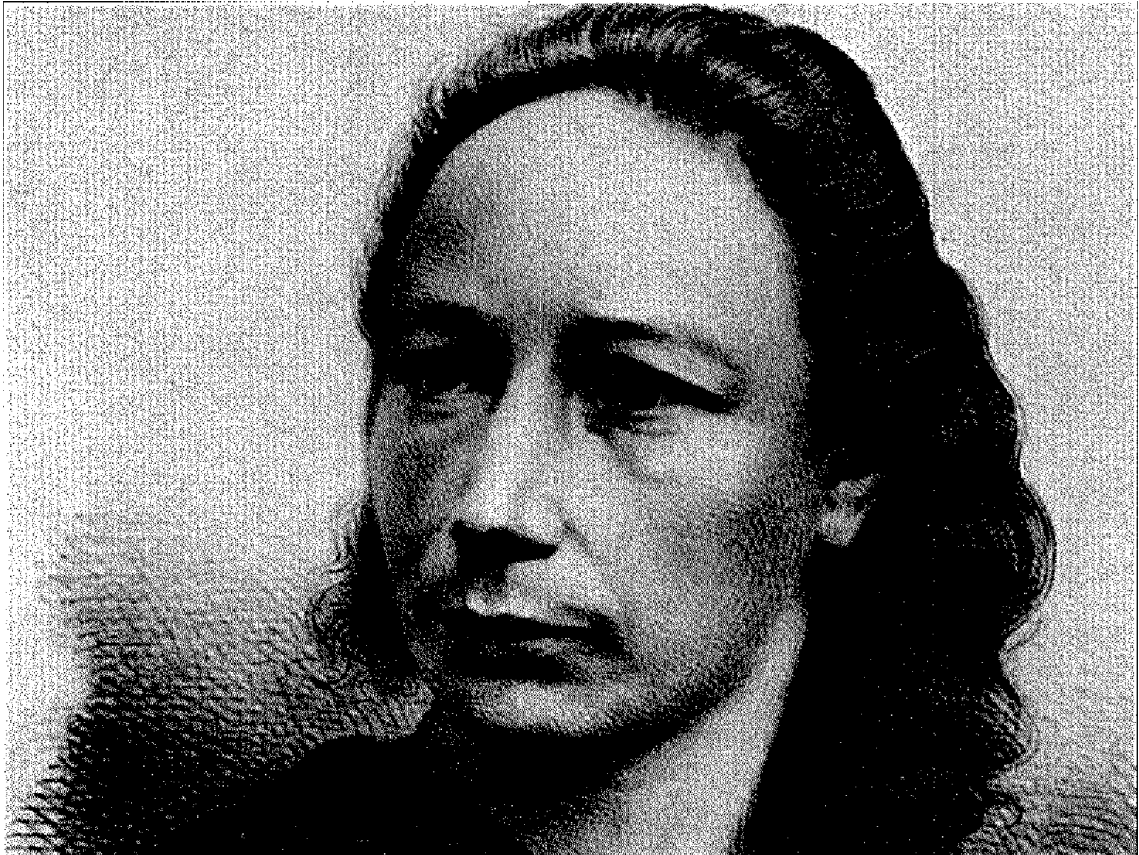
Louise Michel, drawn from life, 1880