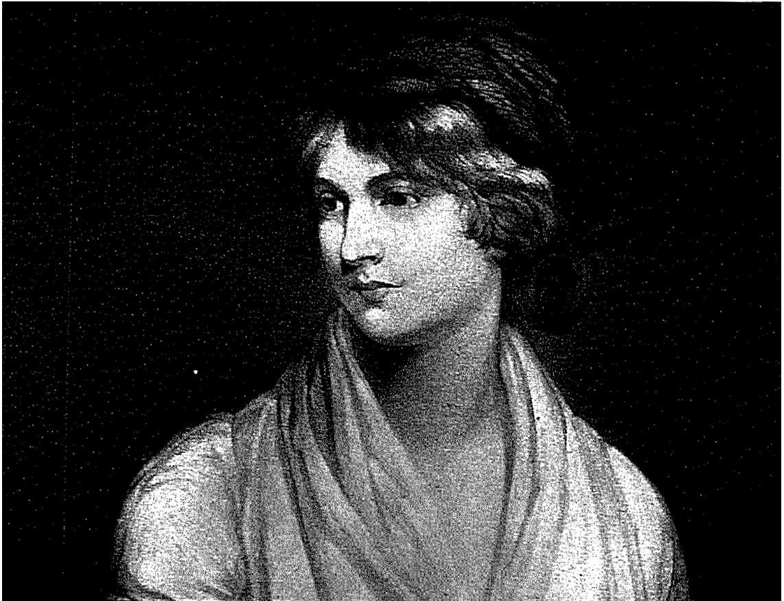
Mary Wollstonecraft (1759-1797)