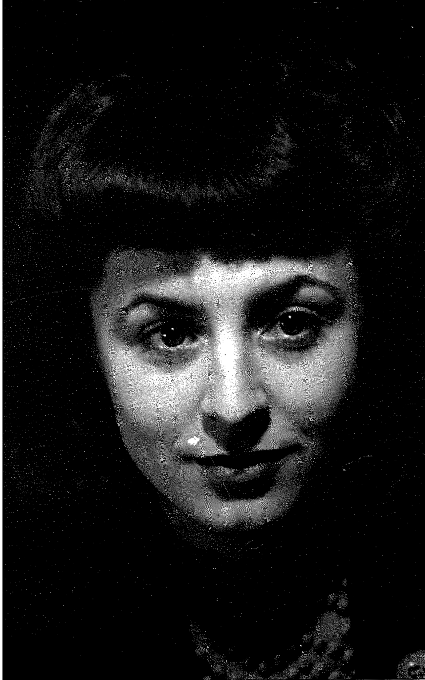
1948 Marie Louise Berneri (1918-1949)