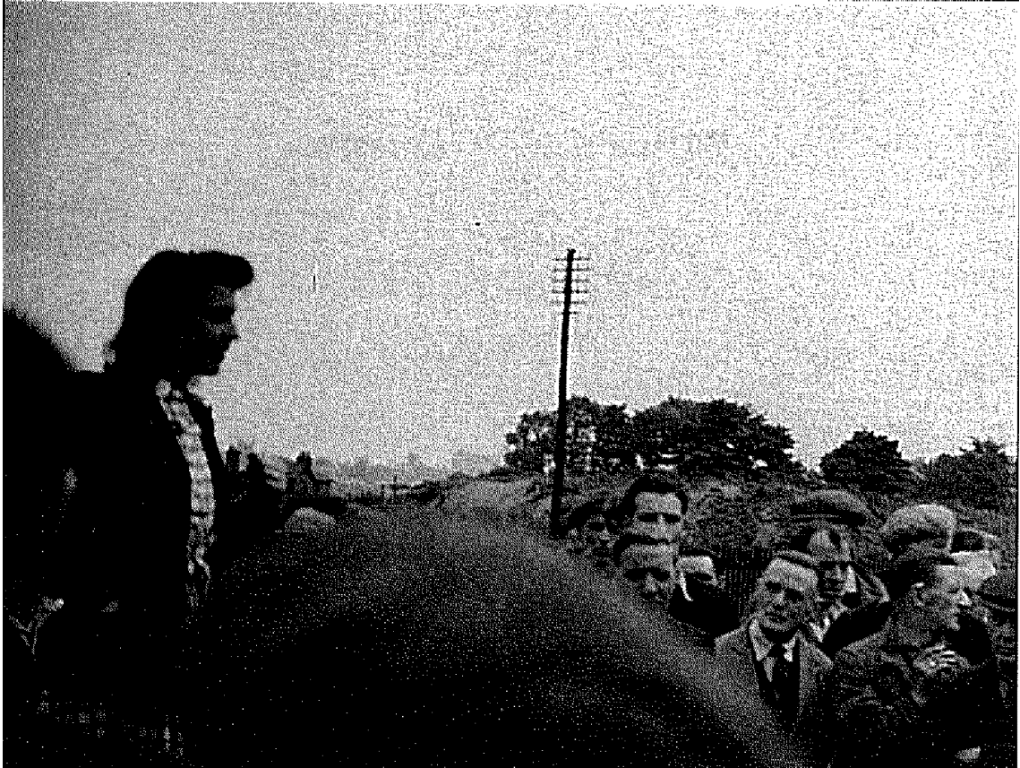
1945 Marie Louise Berneri addressing Glasgow workers