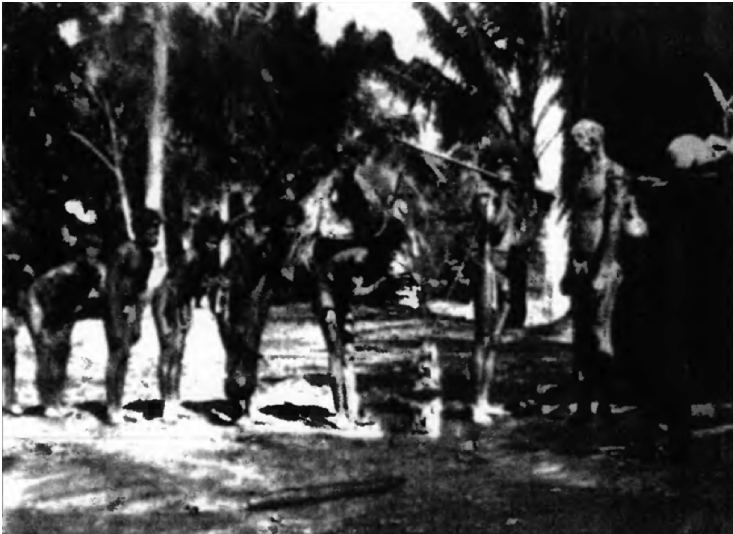
Adam Smith's homo economicus in its natural environment, engaged in financial speculation from the depths of the cave.

There is nothing more false than the notion of barter. All Adam Smith's speculation start from Cook's error regarding the Polynesians, who climbed on board his ship and proposed to the Europeans an exchange, not of objects, but of gifts. The notion of barter – which is supposedly a utilitarian exchange of goods considered as equivalent and in which all would be lacking for it to become commodity exchange would be currency ... – d was born in the 18 th and 19 th centuries, from utilitarianism as we know it. Marcel Mauss gathered together a considerable number of facts dealing with various primitive societies under the head of the concept of the "gift" (cf. His essay, The Gift ), and expressed a few of its universal traits. It now seems that we would hardly be overstepping ourselves to generalize his discovery to all primitive societies. In passing it should be mentioned that all the modern robinsonades start from the same idiotic postulate: to wit, that something called homo economicus lived in caves and on islands – a farce all the more amusing considering that no such species has ever existed, even in the London-style "City," where nonetheless certain cave-dwelling sorcerers called "stock traders" abound.