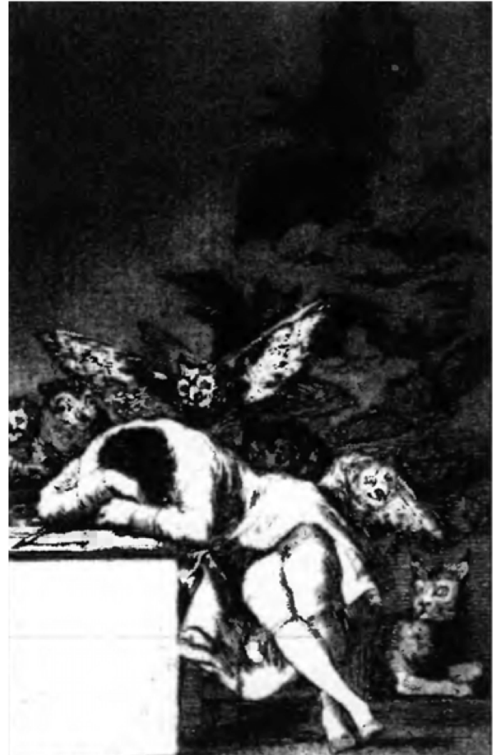
Goya, The Sleep of Reason Produces Monsters . “The spirit of nature is a hidden one, it does not manifest itself in the form of a spirit: it is only a spirit for minds that know it, and it is spirit in itself, but not for itself.”