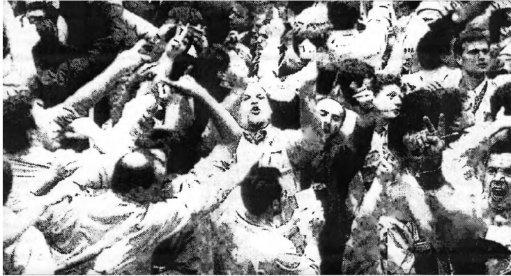
The Frankfurt Stock Exchange