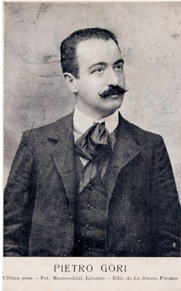
Figure 1 Pietro Gori.