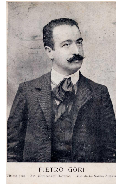
Figure 1 Pietro Gori.

This sort of manifesto came out shortly after the publication of the first of many reports regarding the legal practice Gori conducted in the centre-north of Italy. The anarchist was back in the courtrooms, turning them into a stage for the project promoted by L'Agitazione , which was no less effective than the rallies that were denied to him due to being on parole. 54