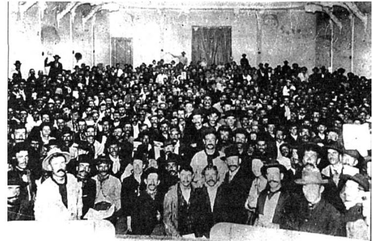
Fig. 9. Maritime workers and dockers affiliated to the Regional Workers Federation of Argentina (FORA) meet in January 1919 on the eve of a general strike.

A second and related dilemma confronting Mexican anarchists lay in the last months of Huerta's rule. Huerta had found