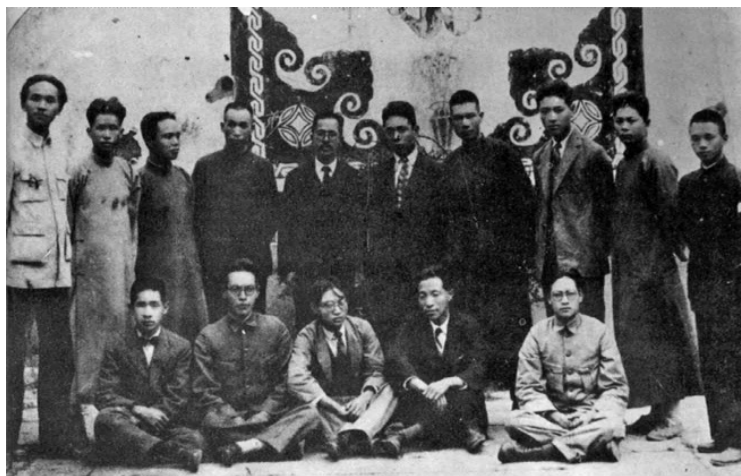
Fig. 2. Members of the Korean Anarchist Federation pose with Chinese comrades involved in a peasant self-management initiative, Pukeun province, China ca. 1927–1928.

Like Cape Town, Durban was defined by “the harbour, the railway and the commerce with the mineral-rich interior”, 135 and developed a significant service and manufacturing sector. The two cities accounted, in fact, for more than half of national manufacturing by the 1920s. 136 From 1905 Durban had the shortest rail link to the Witwatersrand, enabling it to replace Cape Town as the main port. 137 The population by 1910 was 65,000 (around half was white, primarily English-speaking), 138 although the total number doubles if the outlying areas are included. 139 A quarter of the settled population were Indians, mainly descended from indentured labourers, largely low-caste Hindus. While an Indian bourgeoisie emerged, most local Indians were workers, along with small farmers and an educated elite: doctors, interpreters, lawyers, teachers and clerks. 140 Despite the best efforts of officials to whittle down the Indian vote, it was a serious factor in a number of wards in Durban.