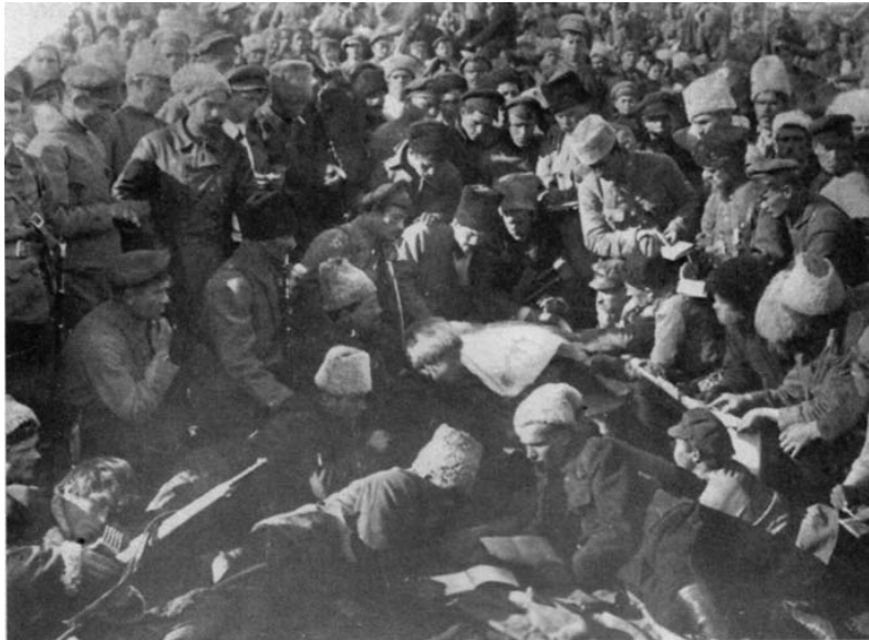
Fig. 4. Makhnovist troops pore over the draft second alliance with the Bolsheviks, Starobelsk, September 1920.

member of the union would be employed and locked out 700 men. 32 The September 1911 rail strike popularized the idea of employer federation. The dispute originated in the dismissal of two porters at Kingsbridge (now Heuston) station, Dublin, for refusing to handle “tainted goods”. As spontaneous action erupted along the railway, the Amalgamated Society of Railway Servants attempted to assert its authority by calling a national strike on 21 September. The decision drew a torrent of criticism in the media, which railed against “foreign” ideas in Irish industrial relations, and alarmed employers. Dublin Chamber of Commerce met in emergency session and urged employers to organise against what one employer termed “not a strike in the ordinary sense ... but the beginning of a social war”. 33