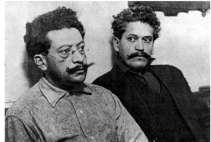
Fig. 8. Ricardo Flores Magón and Enrique Flores Magón, Mexican anarchists, at the Los Angeles County Jail, 1916.