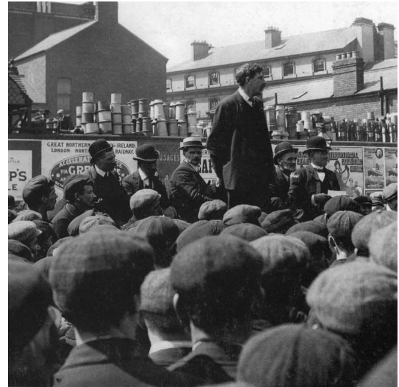
Fig. 5. Jim Larkin speaking in Queen's Square, Belfast, 1907.