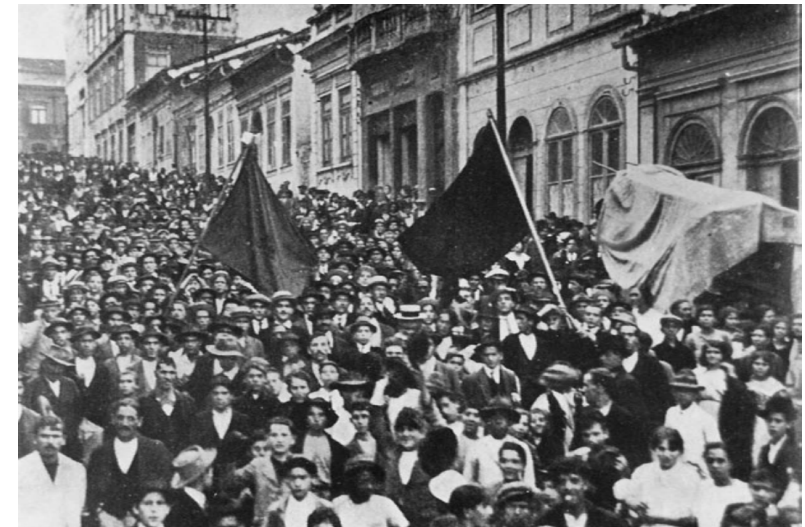
Fig. 10. A crowd scene from the 1917 general strike in São Paulo city, Brazil.