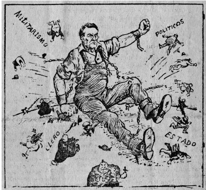
Fig. 7. Peruvian anarcho-syndicalism: breaking the bonds of oppression, exploitation, and ignorance.

President Pardo and the business community refused to bow to the committee's demands. Troops and mounted police were deployed to break up the demonstrations. On May 27 the committee declared a general strike that paralyzed economic activity in Lima-Callao. The general strike lasted for five days. "The net result of the five days of disorder", according to a U.S. observer, "was a death list that may be conservatively placed at one hundred, several hundred wounded, from 300 to 500 prisoners in the Lima jails, property loss and damage that will reach at least two million soles, all business demoralized for a week and a severe lesson imposed upon the anarchistic Maximalist elements of Lima and Callao and their misguided followers". 19