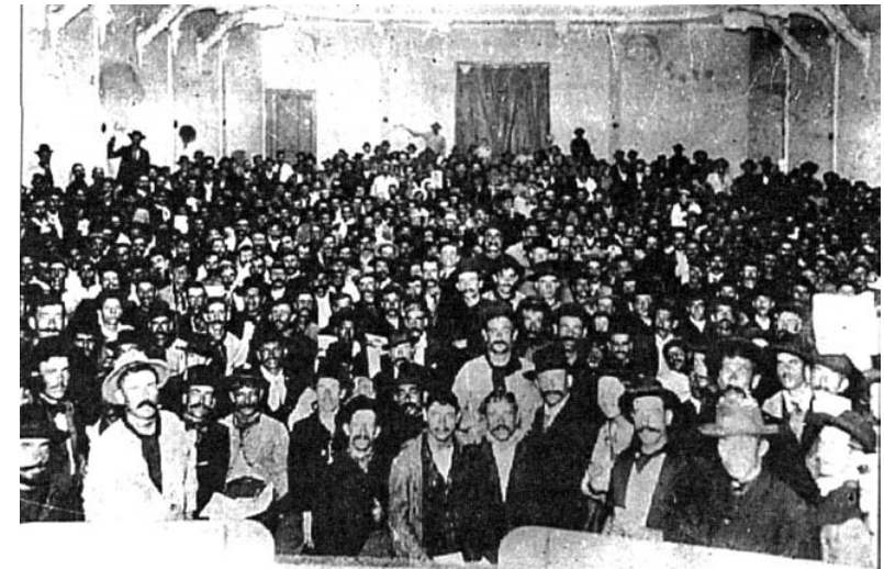
Fig. 9. Maritime workers and dockers affiliated to the Regional Workers Federation of Argentina (FORA) meet in January 1919 on the eve of a general strike.