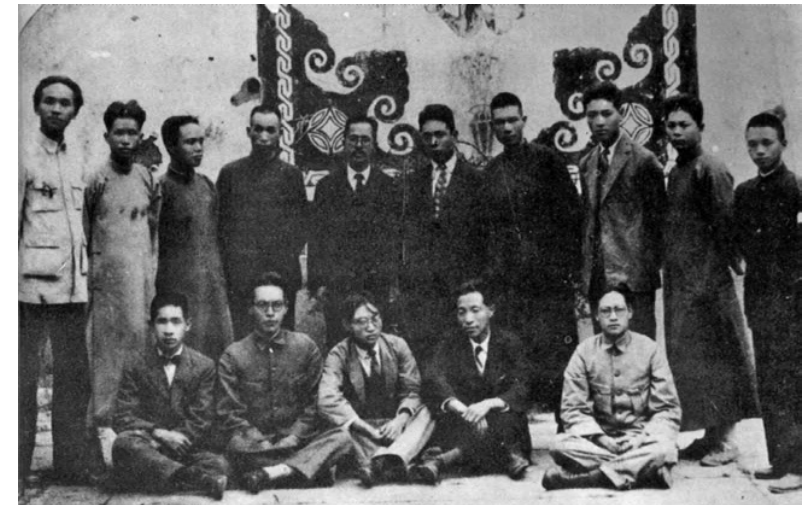
Fig. 2. Members of the Korean Anarchist Federation pose with Chinese comrades involved in a peasant self-management initiative, Pukeun province, China ca. 1927–1928.