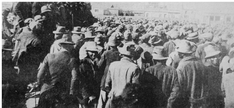
Fig. 1. African workers attend a rally in Johannesburg, addressed by members of the Industrial Workers of Africa, the International Socialist League and the South African Native National Congress, June 1918.

The vehicle of this combined struggle was usually envisaged as a revolutionary interracial One Big Union on the model of the Industrial Workers of the World (the IWW, or Wobblies): “The key to social regeneration ... to the new Socialist Commonwealth is to be found in the organisation of a class conscious proletariat within the Industrial Union”, 1 creating an Industrial Republic “administered ... democratically by the workers themselves”. 2