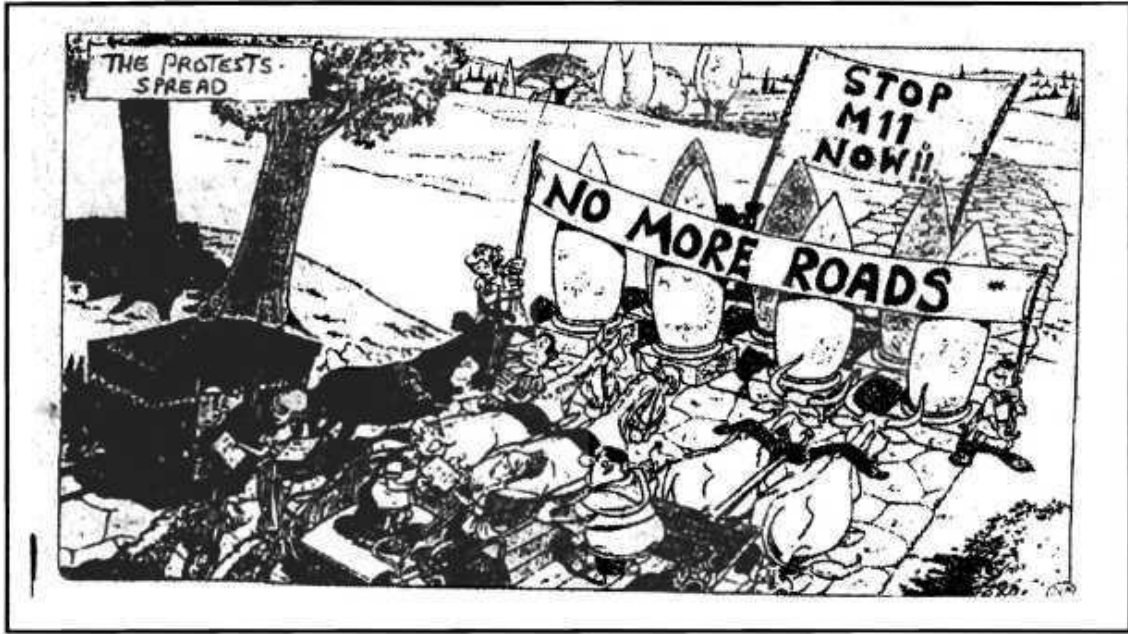
Asterix and the Road Monster-Road blockades, Roman Style!

into their protest culture, anti-roads protesters borrowed this character and transformed him into a champion of the movement through the comic book, Asterix and the Road Monster . This depicted fellow character, Obelex, with a huge ELF logo on his chest, swinging Romans above his head. Apart from the action, the comic book made a concerted effort to valorize worker solidarity, animal rights, feminism, and local communities against the corporate forces stacked up against them.