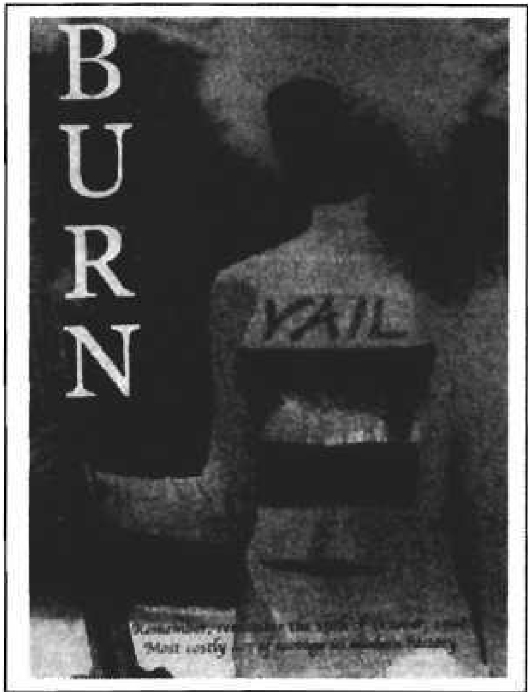
Elves cross the Atlantic, Vail, CO 1998