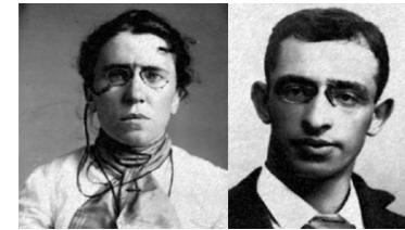
Emma Goldman and Alexander Berkman