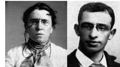
Emma Goldman and Alexander Berkman