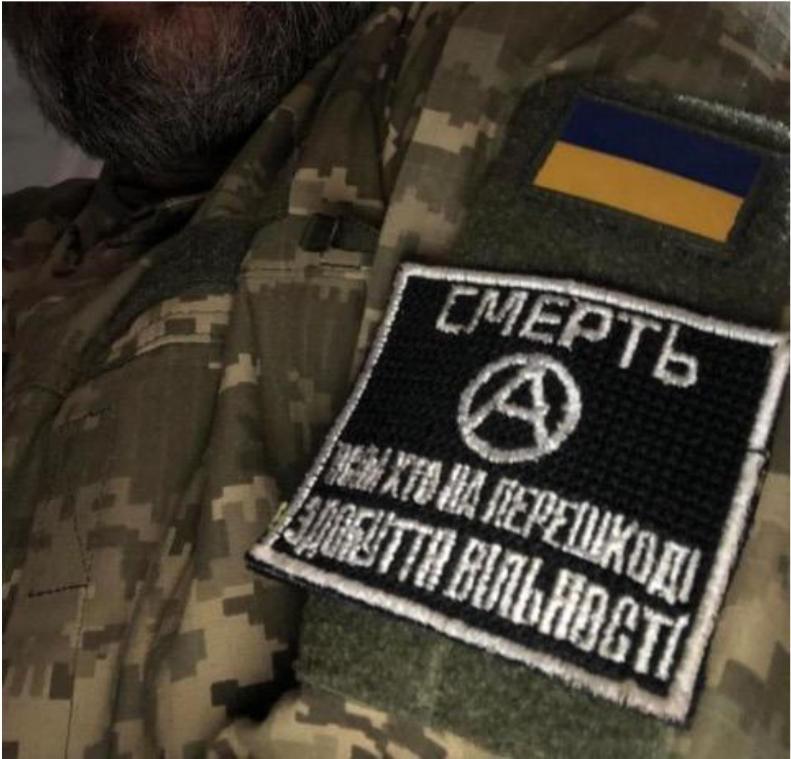
Ukrainian soldier with “Death to All Who Stand in the Way of Freedom” patch