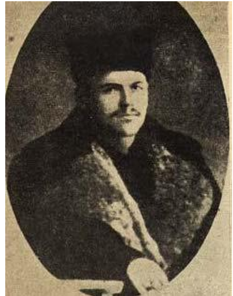
Ostrovskii “false” Makhno photo

the supposed photo of Makhno produced by Ostrovskii, which Makhno irritatedly rejected, bears a striking resemblance to Petro Kotsur.