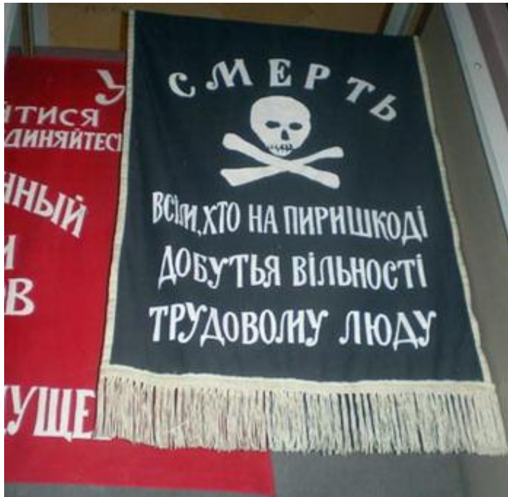
“Death to All ...” replica flag in the Makhno exhibit room at the Huliaipole Local History Museum

seum exhibits like the one in Nestor Makhno's hometown of Huliaipole. The slogan, and variations thereof, are also seen on frontline Ukrainian soldiers' patches and flags in the current war with Russia. Ukrainian and Russian anarchist organizations frequently evoke the flag and slogan in their propaganda. In the context of today's war, the slogan is understood as a Ukrainian rallying cry for resistance against the Russian state's invasion.