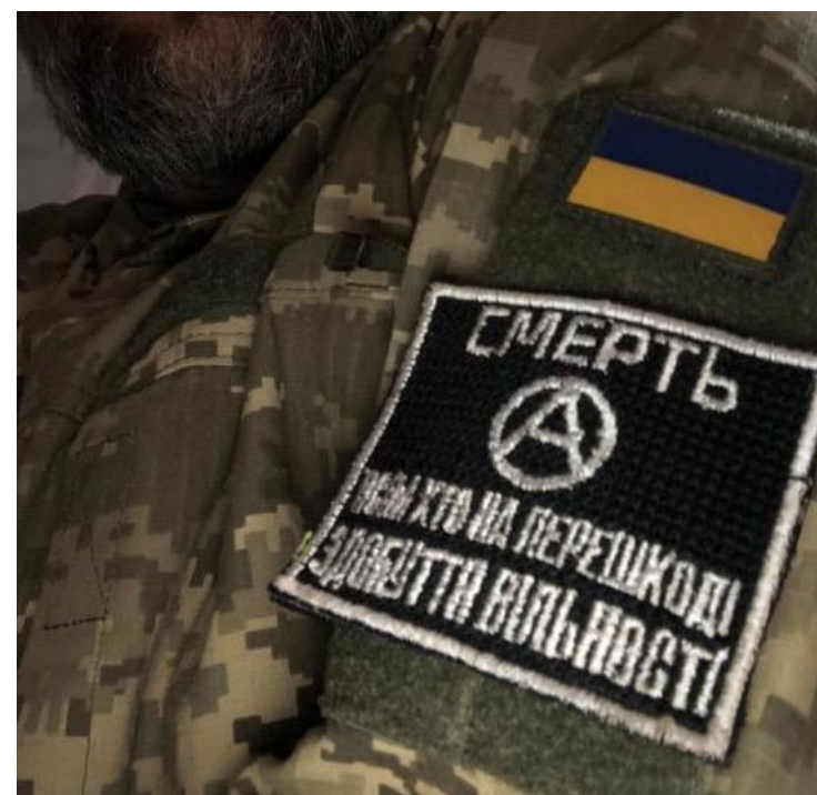
Ukrainian soldier with "Death to All Who Stand in the Way of Freedom" patch

Since the flag's first appearance in Ostrovskii's 1926 book, the flag has become completely divorced from its origins. It has cycled through a multitude of meanings from an ignoble marker of alleged Makhnovist pogroms to an international source of inspiration for anarchist resistance to a symbol of regional pride and a declaration of defiance against Russian invasion. In one form or another the flag and its slogan will surely survive and continue its march through time.