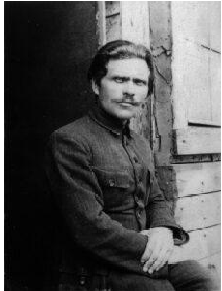
Nestor Makhno, 1921