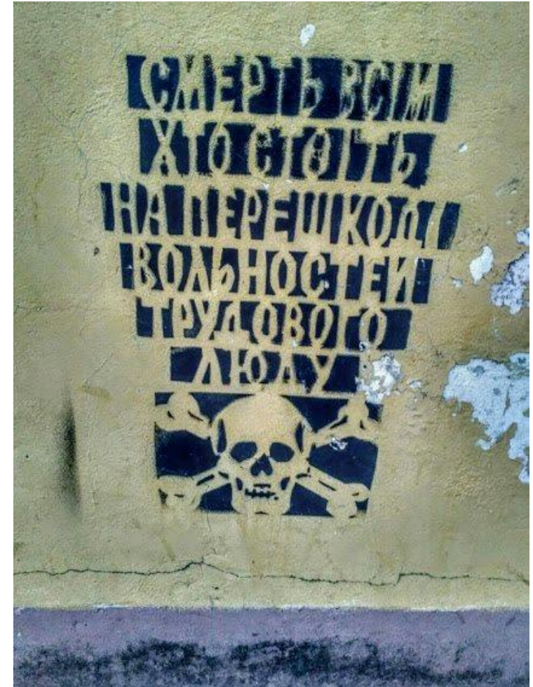
Ukrainian street graffiti

and the spreading of mythologies about under researched and highly politicized topics like the Makhnovist movement.