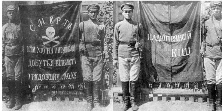
Reverse side of banner (right hand image)

were almost exclusively published in Russian. 21 Secondly, the soldiers holding the flag do not look like typical Makhnovist partisans, who often wore mismatched outfits rather than identical uniforms. Nonetheless, these red flags, as it were, did not prove Makhno's claim. Moreover, the photo's official entry in the Ukrainian archives lists it as "Banner of the Makhnovists. 1920". 22