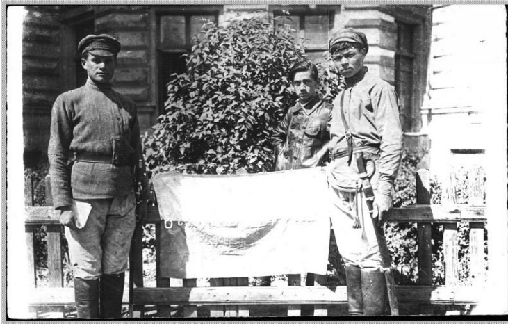
Red Army soldiers with a captured flag of the 1 st Cavalry Cossack regiment “Free Ukraine”

telligence officers. 32 This suggests that the photo set is of Bolsheviks displaying captured battle flags.