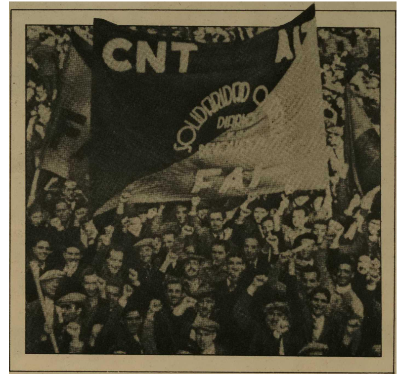
Mass rally of anarcho-syndicalist CNT during Spanish Revolution.