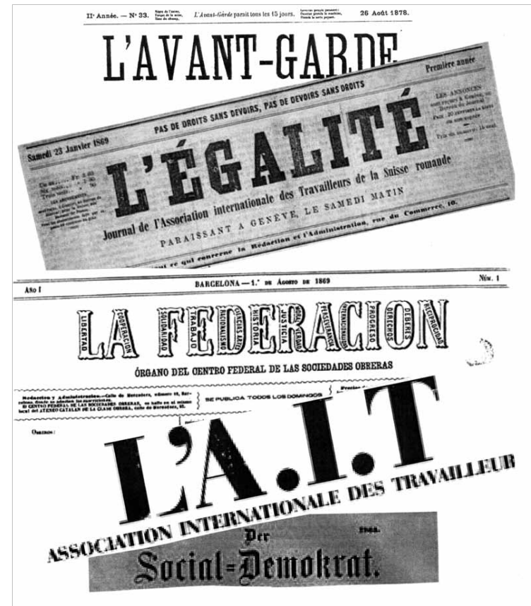
Mastheads of journals from IWA organisations in France, Spain and Switzerland, and from German Social-Democrats