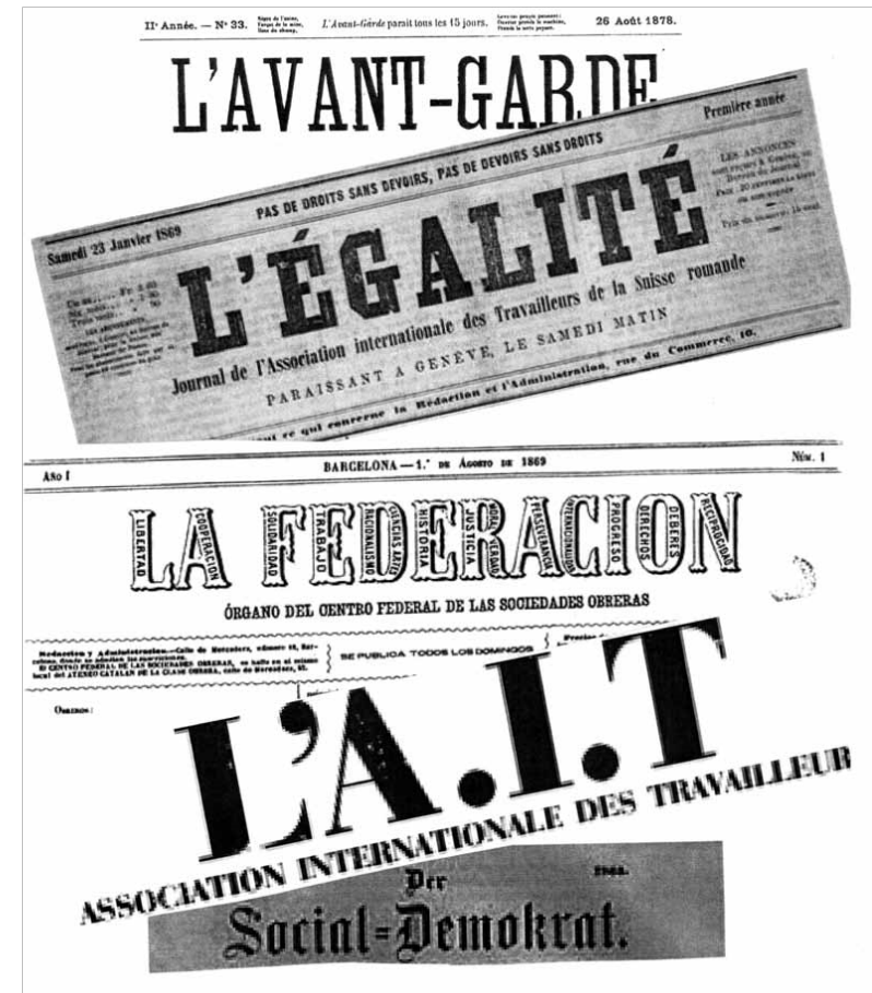
Mastheads of journals from IWA organisations in France, Spain and Switzerland, and from German Social-Democrats

Of late, the Social-Democratic philistine has once more been filled with wholesome terror at the words: dictatorship of the proletariat. Well and good, gentlemen, do you want to know what this dictatorship