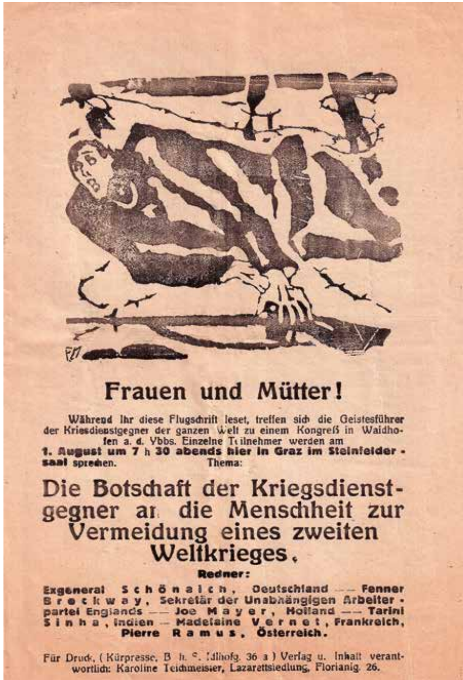
Fig 10: Invitation of the B.h.S. and the League of War Service Resisters to a demo against war in Graz on August 1, 1928 with speakers who took part in the conference of "War Resisters International" in the Lower-Austrian town of Sonntagsberg. Front side of the flyer. Graz, 1928.