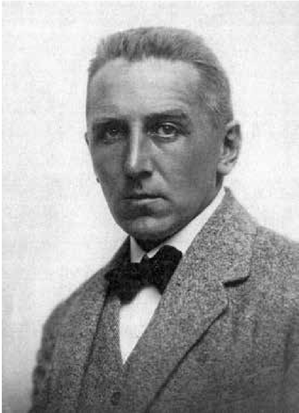
Fig 12: Herbert Müller-Guttenbrunn. Graz, circa 1925