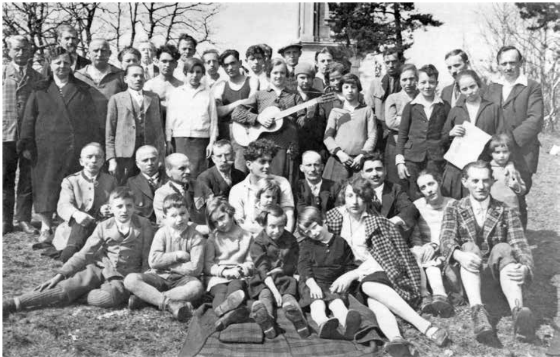
Fig 6: Excursion of the Singer's Circle "Freedom" of the B.h.S. near Graz, 1929.