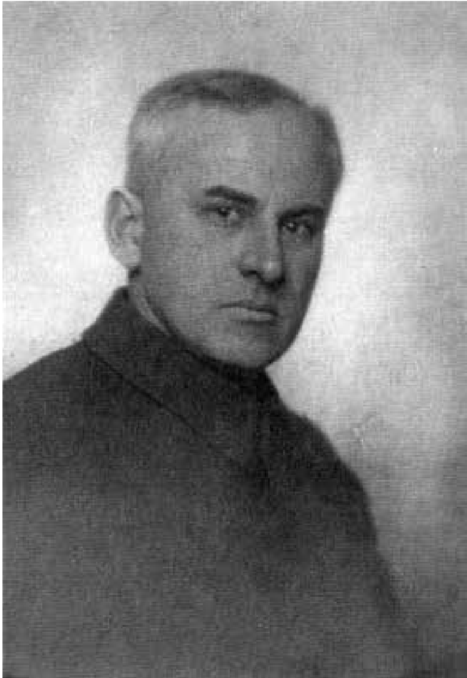
Fig 9: Othmar (From 1899–1918 Edler von) Zawodsky. Graz, in January, 1932.