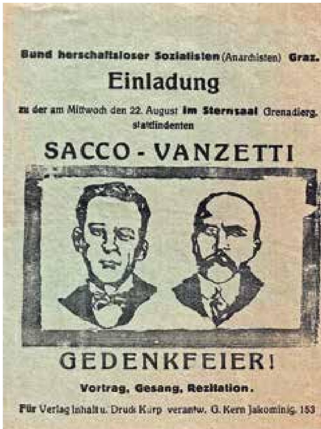
Fig 13: Invitation to a memorial by the B.h.S. Graz on August 22, 1928, for the one year anniversary of the judicial murder of the American anarchists Niccola Sacco (1891–1927) and Bartolomeo Vanzetti (1888–1927). Graz, 1928.