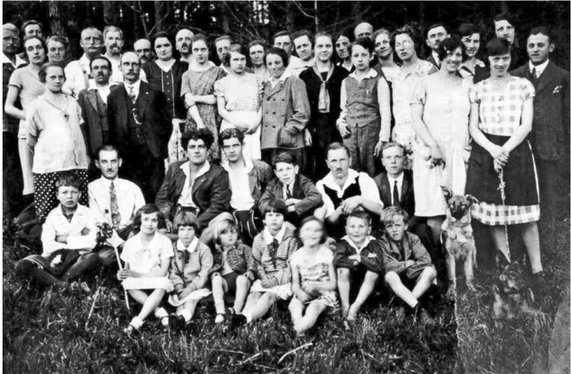
Fig 17: Excursion of members of the former B.h.S. in the Graz surroundings. Circa 1934.