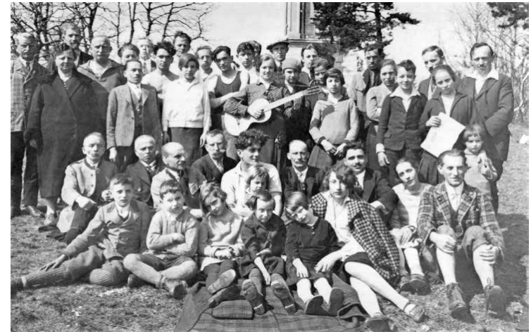
Fig 6: Excursion of the Singer’s Circle “Freedom” of the B.h.S. near Graz, 1929.