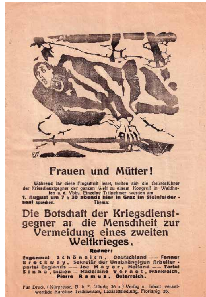
Fig 10: Invitation of the B.h.S. and the League of War Service Resisters to a demo against war in Graz on August 1, 1928 with speakers who took part in the conference of “War Resisters International” in the Lower-Austrian town of Sonntagsberg. Front side of the flyer. Graz, 1928.