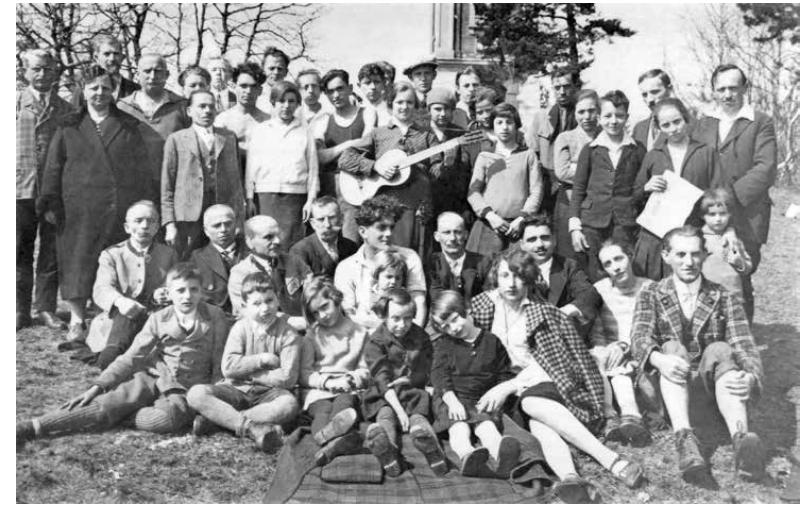
Fig 6: Excursion of the Singer’s Circle “Freedom” of the B.h.S. near Graz, 1929.