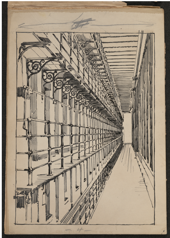
Figure 2. Berkman's Sketch of Penitentiary Cells

Note: Alexander Berkman, "Drawings and Prints of the Penitentiary and of an Advertisement for the 'Union Broom' Made by the Prisoners" n.d.