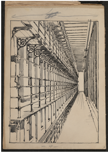
Figure 2. Berkman's Sketch of Penitentiary Cells

Note: Alexander Berkman, "Drawings and Prints of the Penitentiary and of an Advertisement for the 'Union Broom' Made by the Prisoners" n.d.