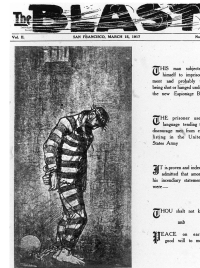
Figure 3. Cover of The Blast , March 15, 1917

Billings and Mooney, Margaret Sanger, Goldman, the Magón brothers, and Carlo Tresca, its pages peppered with advertisements for the Prison Memoirs yet with little about incarceration itself.