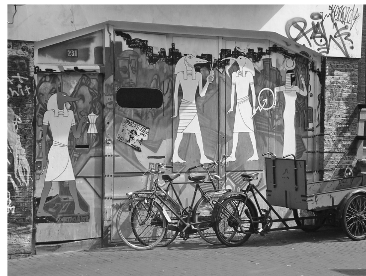
2.1 A squat on the Spuistraat in the center of Amsterdam, 2006

Versus the threat of the white, middle-class, yuppie, the discursive “neighbor” is thoroughly working class and can be either white Dutch or working-class immigrants mainly from Turkey or Morocco. While calling someone a yuppie is an insult and a term of contempt, referring to them as neighbors reflects a relationship of attempted solidarity – whether or not such solidarity exists. Squatters who communicate with the neighbors and work with them together on campaigns receive respect and accrue squatter capital. As in many aspects of squatter capital, this valorization signifies that it is generally unusual for squatters to put energy into creating good relationships with their neighbors.