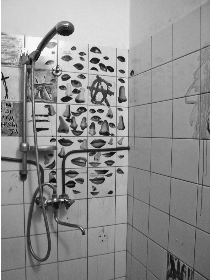
3.1 Shower inside of a squat, 2006

she should have asked for assistance or delegated the task to someone who had the capacity to handle it.