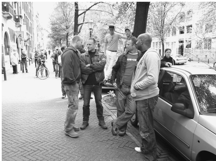
1.4 Plainclothes police officers attempting to look casual prior to a squat's eviction, 2006

random circumstances and the assertiveness of others in the squatting community who intervene, enable the success of action. For example, in the squatters' community where I lived, resided a group of three Eastern European men. None spoke Dutch and could barely speak English. In my experience with them, they were always either drunk or high from a cocktail of drugs that ranged from marijuana (commonplace for squatters) to heroin (taboo). Despite their language handicaps and their addictions, they managed to eke out a living in Amsterdam by playing music and performing on the street for tourists. To squat their flat, they required tremendous assistance from the members of the kraakspreekuur who performed the research, organizational, and communication tasks on the squatters' behalf without being explicitly asked since these men lacked even the capacity to ask for such assistance.