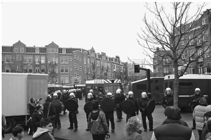
1.3 Eviction of a squat in Amsterdam, 2008

These campaigning tactics are well within the repertoire of squatter campaigning for the past forty years. Talking about the mafia and its use of real estate to money launder and constructing narratives which play on populist Amsterdam sensibilities that hate real estate speculation has proved relatively successful for those who campaign by leading to either the legalization of their squat or being offered low-cost rental housing.