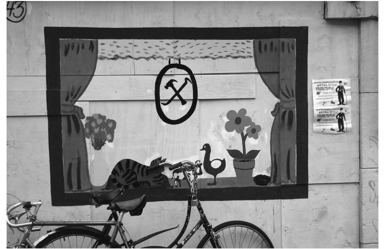
4.3 The painted exterior of a squat, 2008