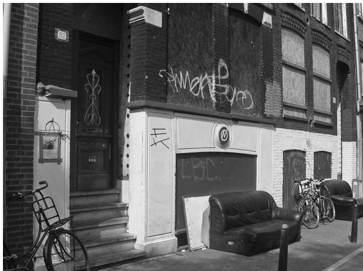
2.2 Squatted building alongside a canal in the Jordaan neighborhood, 2006

twenty page list of things you should live by if you want to rent a room from them. And in my opinion, that's ... I don't find that very honest. Or giving people a bit of freedom. And I think that is a very wrong way to convince people of Christianity.