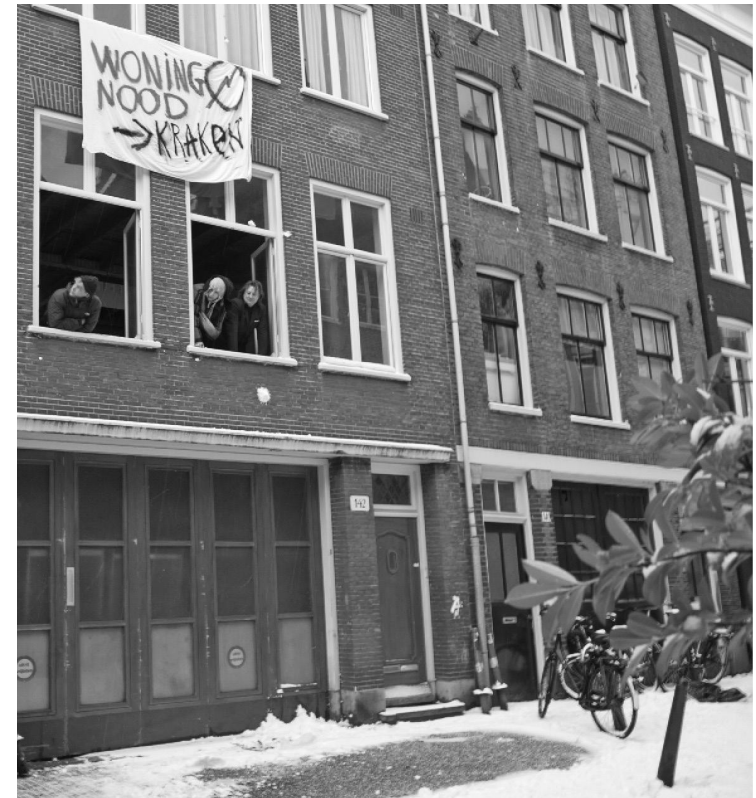
2.4 Banner outside of squat that states: Housing shortage → Squat