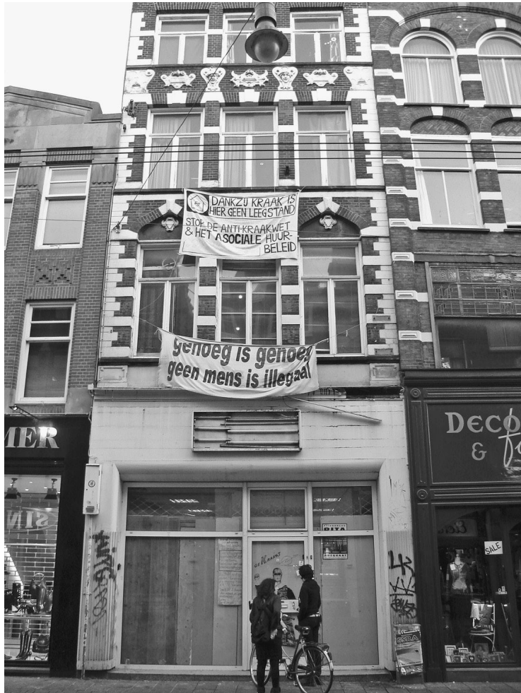
3.2 The “Leidsbezet,” a squatted social center in the center of Amsterdam, 2006