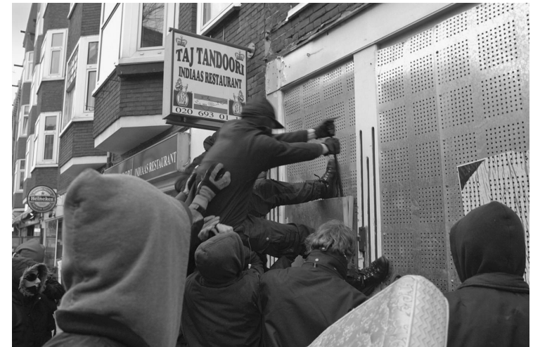
1.2 Breaking open the door during a squatting action

Eviction waves occur approximately three times a year and they constitute the ultimate form of the front stage in the squatters movement because squatters consciously treat these events as performative rituals to communicate with the police, the state, and the imagined Mainstream. The city contracts the riot police to evict all squatted houses with eviction notices on the same day to avoid the costliness of evicting on a more frequent basis. The "riot" between squatters and police is highly institutionalized since it has occurred frequently during the forty years of the movement's history. As a result, the primary performers comprise the squatters and the police, and the audience consists of members of the activist community, random observers, neighborhood residents, and the press, who expect particular types of performances. I base these observations on having witnessed a number of eviction waves and having been evicted by riot police twice, once as part of an eviction wave while the second surprised me and the other fifty people evicted and arrested.