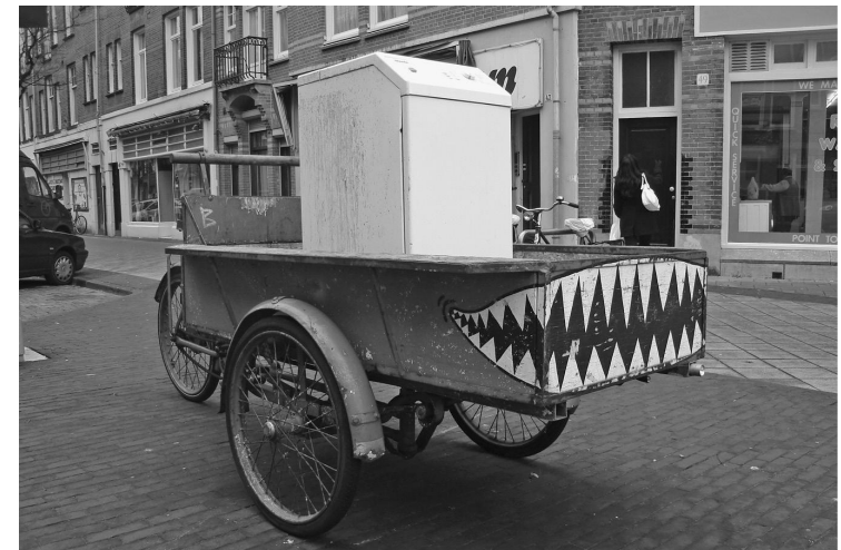
5.1 A utility bicycle built by squatters and used collectively, 2008

Gamson, William A. 1990. The Strategy of Social Protest . 2nd edn. Belmont, CA: Wadsworth.