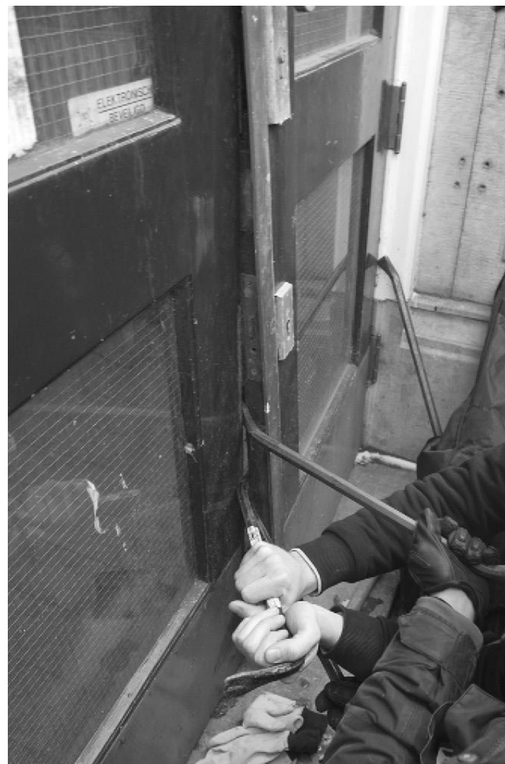
1.1 Breaking open a door during a squatting action, 2008