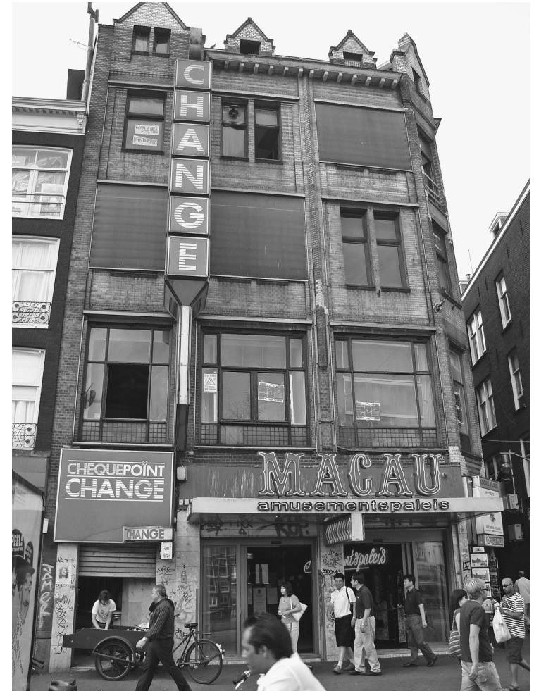
3.4 Building on the Damrak, where ground floor space was in use commercially while upper floors were squatted, 2006