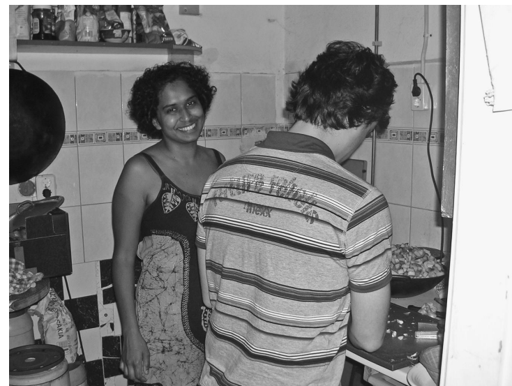
0.3 The author cooking in a squatted restaurant, 2006

According to Graeber, activists who participate in collective action as a revolt against oppression, however, are often people of color and/or immigrants who do so through hierarchical organizations that combat specific discriminations. Thus, the difficulties that these groups have working together derive from wildly divergent underlying motivations. Furthermore, Graeber contends that the racial and class privileges inherent in the lifestyle choices, clothing styles, and consumption practices of self-identified hippies and punks who constitute the antiglobalization movement often offend activists who revolt against racialized and class oppression, since they would never be permitted to engage in practices such as "dumpster diving" or fighting in a black bloc without far more severe and violent