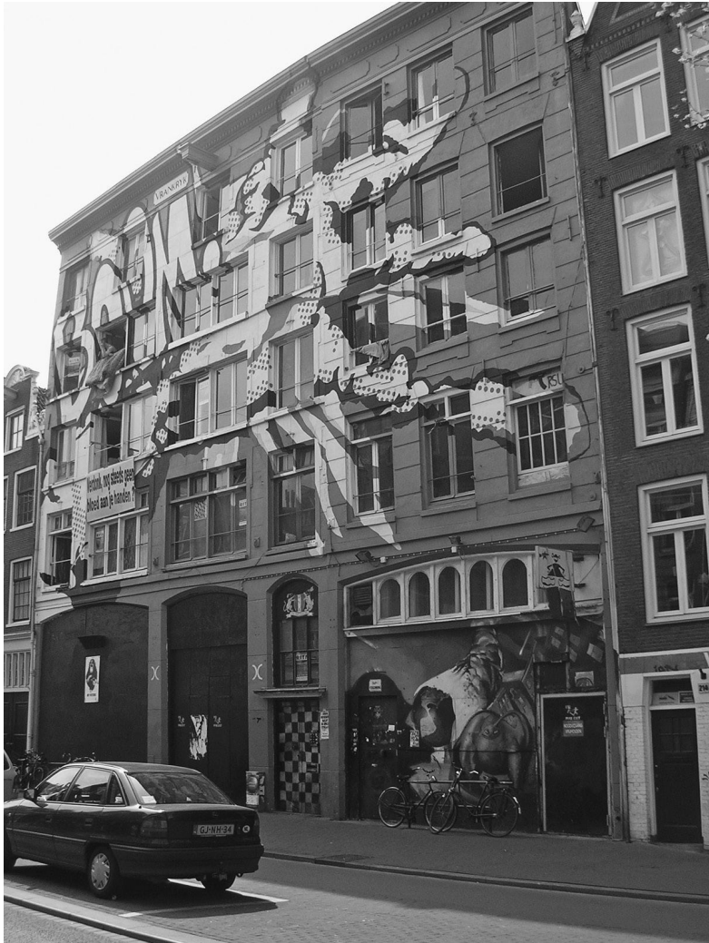
0.1 The Vrankrijk legalized squat, 2006

policy and the presidency of Ronald Reagan. The women's movement manifested in the squatters' subculture through a number of squats that banned the presence of men, to the point that during alarms, they permitted men to stand in front of the house but did not allow them to enter the squat to defend it from eviction.