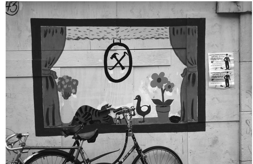
4.3 The painted exterior of a squat, 2008

As in the case of Karima, or anyone who does not fit into the two extremes of squatter personhood – the culturally central activist versus the culturally marginal participant – the need for material and bodily security renders a squatter unable to reach a state of autonomy. Examples include the single mother juggling a low-income job, benefits, and raising her children, while illegally subletting an apartment that costs more than her total income; or the undocumented refugee who fled a war zone, has been rejected by the Dutch refugee machinery, and lives in the margins of Amsterdam. They can be tolerated within the community but not treated as equals within the framework of squatter capital and standards for being recognized as autonomous. If one is afraid of the police, lacks interest in participating in violent actions and going to jail, finds barricading and occupying time-consuming and stressful, or feels intimidated by the barrage of paperwork, owners, and