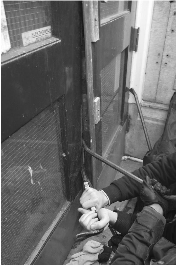
1.1 Breaking open a door during a squatting action, 2008

movement in Amsterdam. Communal living groups within squatted households both reflect and refract larger movement dynamics of hierarchy and authority. They reflect larger movement standards in the sense that one's squatter capital contributes to one's status position within a squatted household. They refract in that within a household, the highest values are to maintain a lively and peaceful group dynamic, silently maintain the unspoken hierarchies within a group without challenging them, and to avoid tension and conflict.