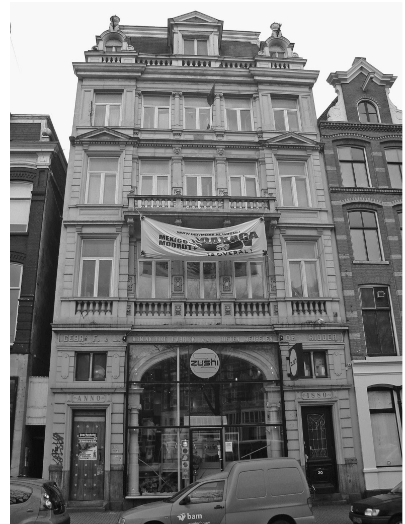
3.3 A squat alongside the Amstel River in the center of Amsterdam, 2006