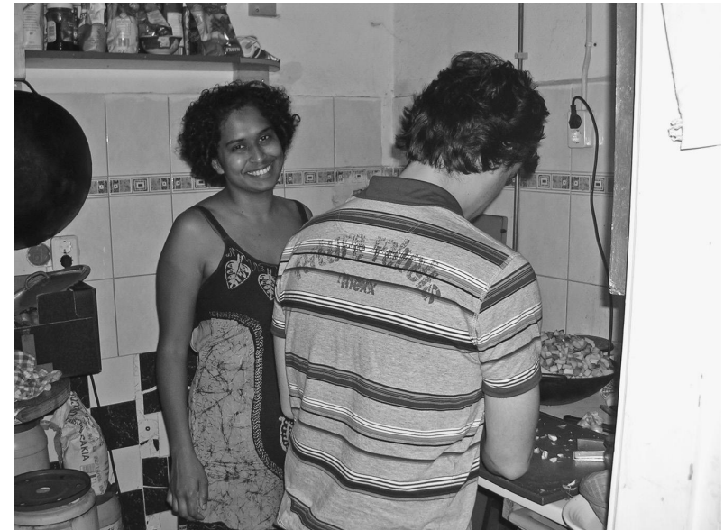
0.3 The author cooking in a squatted restaurant, 2006