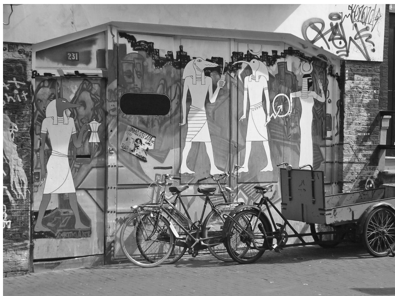
2.1 A squat on the Spuistraat in the center of Amsterdam, 2006

violent. The police perform “uber-toughness” in this interaction as well. They sport new gadgets, enormous trucks, and align themselves in military formation, with shields, weapons, and helmets. Each eviction wave costs thousands of euros for the city.