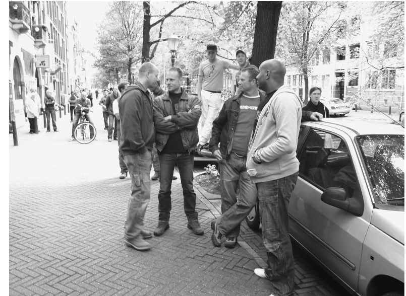
1.4 Plainclothes police officers attempting to look casual prior to a squat's eviction, 2006