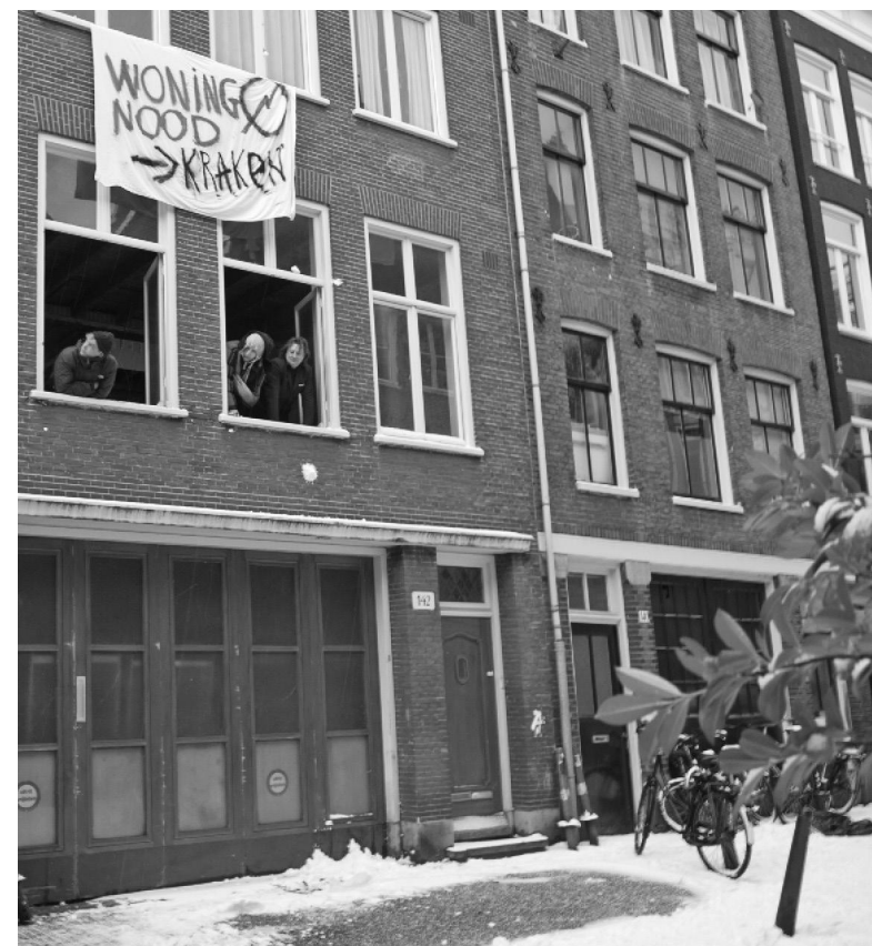
2.4 Banner outside of squat that states: Housing shortage → Squat

The following is a compilation of gossip that I have heard about Dominic from a number of women. To be clear, I cannot confirm