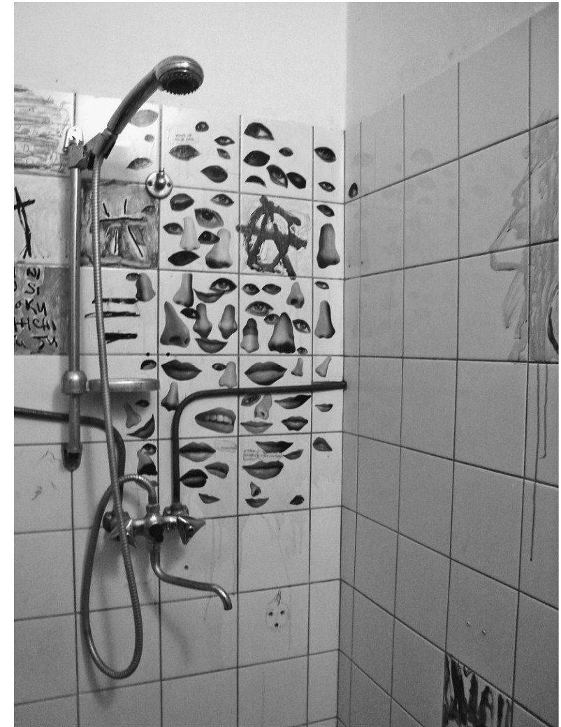
3.1 Shower inside of a squat, 2006

Tall, blond, blue-eyed, and broad-shouldered Fleur was raised on a houseboat in a sailing community in north Holland – a member of the, as she calls it, “respectable working class.” Although at the time of writing, houseboats are fashionable in the Netherlands, when Fleur was a child, houseboats connoted “trailer trash” with its own community-based subculture. She grew up in a tight-knit, social democratic family in which both her parents worked as captains of tourist boats. Fleur disavows anarchism and proudly