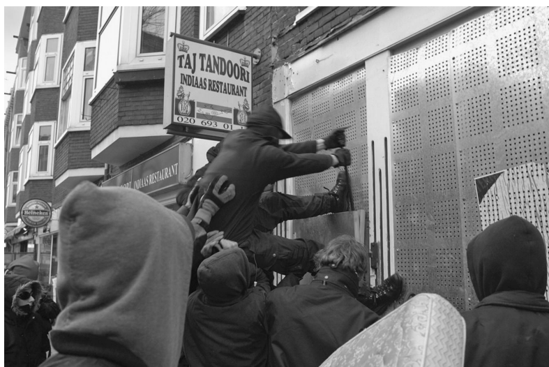
1.2 Breaking open the door during a squatting action

Chapter 1), I realized after a few months that the cost of squatting had outweighed the benefits and moved to rental accommodation to finish my dissertation.