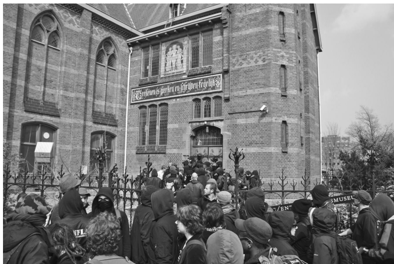
4.1 The squatting of Drawing School, part of the Rijksmuseum, 2008

while guests live off their labor parasitically. It is also common for guests to simply never leave unless the living group forces them out, which proves uncomfortable for everyone involved.