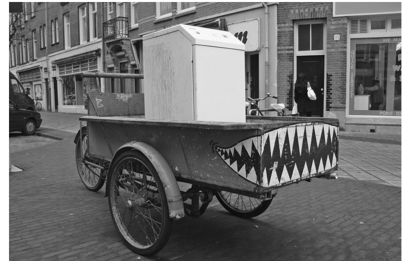
5.1 A utility bicycle built by squatters and used collectively, 2008