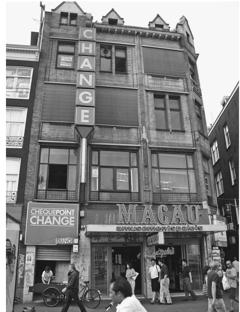
3.4 Building on the Damrak, where ground floor space was in use commercially while upper floors were squatted, 2006

Squatted houses present a convergence of the public and private in a dramatic way. On one level, these houses are private spaces, where ideally a resident should feel comfortable in a convivial and warm living group, which provides a safe haven from urban alienation via an alternative to the nuclear family. However, they are also public spaces in that they both constitute and are produced by a social movement. Hence, movement capital of individual residents impacts the micro-social dynamics of the group. Further,