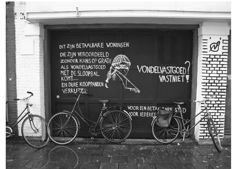
2.3 Pro-squatting graffiti in De Pijp neighborhood, 2006