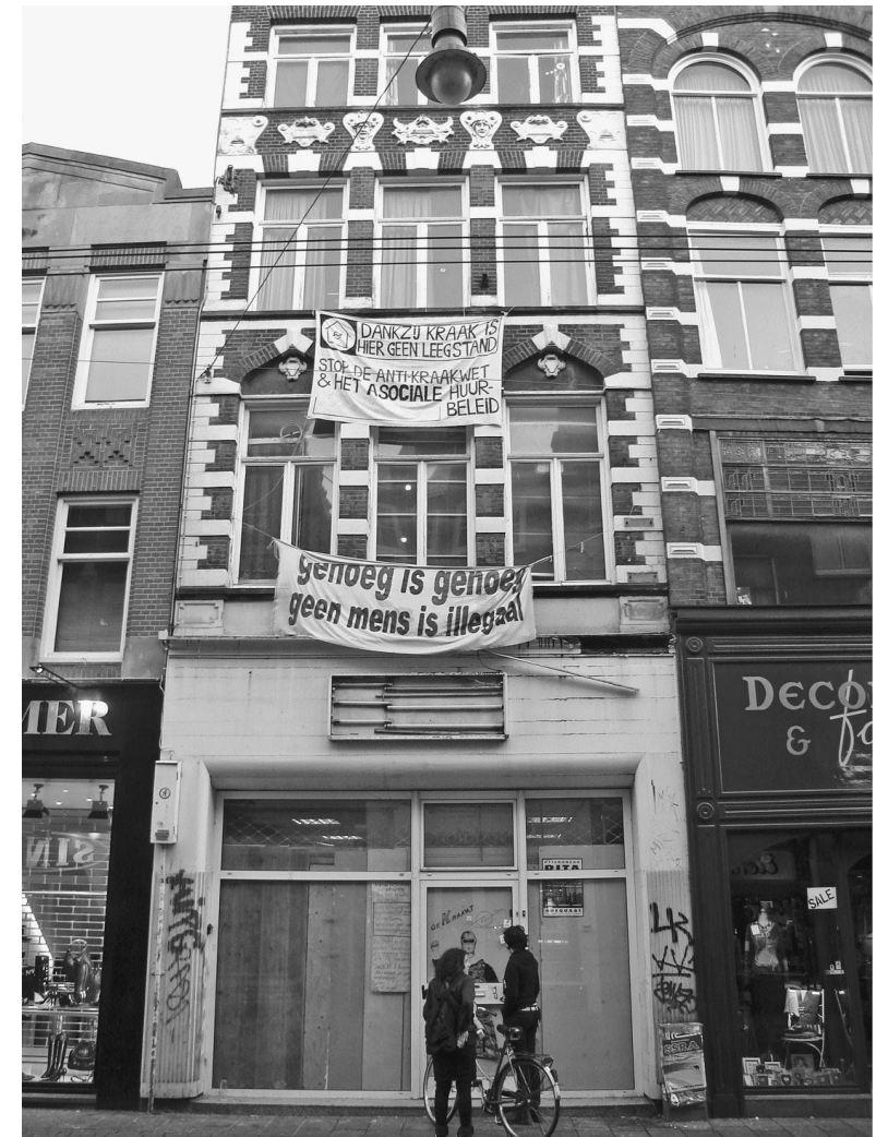
3.2 The “Leidsbezet,” a squatted social center in the center of Amsterdam, 2006

A few ethnographies of subcultures offer insight by charting the careers of subcultural participants. Fox (1987), in her ethnographic research on punks in the American Midwest in the 1970s and 1980s, found that punks hierarchically organized themselves into subgroups according to the intensity of individual commitment to the punk counterculture and their performance of a punk fashion and lifestyle. With more intense commitment, the more exclusive the subgroup becomes. Hardcore punks consist of participants who demonstrated the strongest devotion to the punk lifestyle and value system and who possessed the highest status. Softcore punks were less devoted than the hardcores to the oppositional punk lifestyle and had relatively less status than hardcore punks. However, the hardcore punks considered the softcore's involvement as sufficient and generally viewed them as transitioning towards hardcores. The preppie punks, who Fox characterizes