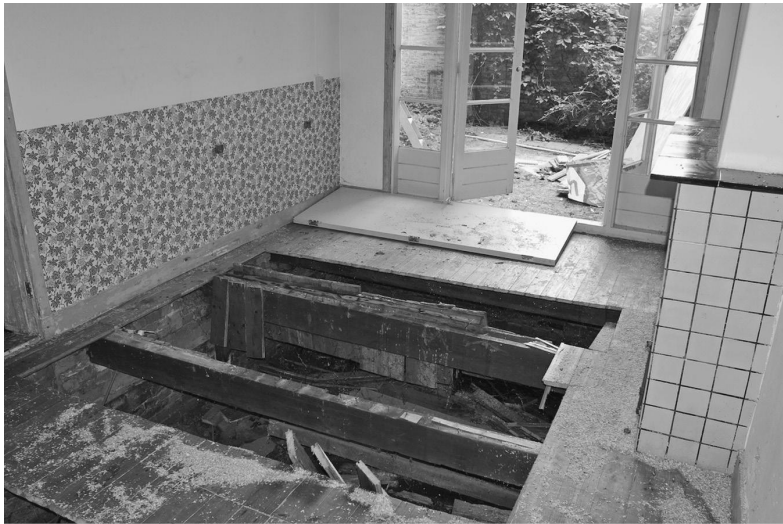
4.2 Interior of a newly squatted apartment that requires rebuilding floors, Amsterdam, 2009

autonomous life is a fiction, a narrative on the movement's front and back stages that masks a deeper collective yearning for belonging and love through the performance of a non-conformist, anti-capitalist, individualist self. This fraught ideal is impossible to achieve and requires a constant disavowal and double-speak.