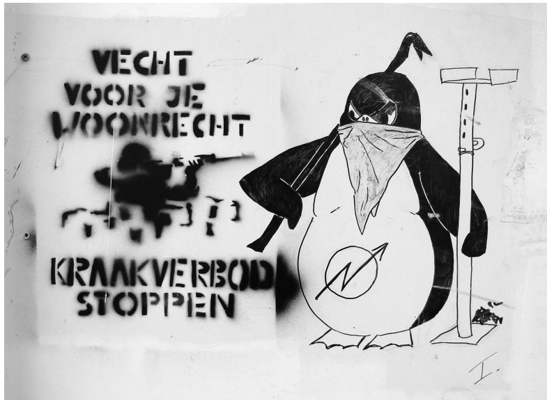
0.2 Graffiti against the squatting ban circa 2006: "Fight for your housing rights. Stop the squatting ban"

taken over the street, and say, repeatedly: "Fucking Muslims. Fucking Muslims."