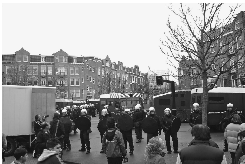
1.3 Eviction of a squat in Amsterdam, 2008

history of violent repression of protests or where the state is a liberal, Western European democracy, but the protesters are less privileged citizens, such as members of minority groups. The literature assumes the structural locations of these activists – which is highly educated, middle-class, privileged, white, and often European or American but never explicitly speaks to these conjectures and how the authorities' response to protesters differs vastly if they were not assumed to be privileged whites (take, for example, the civil unrest in Paris suburbs created by working-class Muslim immigrant youth in 2005, to which the French state reacted by brutally policing the residents of these neighborhoods).