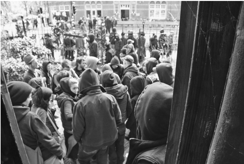
i. Squatting Action Amsterdam, 2008

interviews with squatters, they often expressed a heavy nostalgia concerning a mythical heyday. In the 1970s, they referred to the late '60s; in the late 1970s, the early '70s. In 1981, they extolled 1980 as the moment of authentic activism, and in the mid-80s, the early 1980s was the high point. By the 1990s, this sentiment became “the '80s,” a mythmaking discourse which continues up to the present.