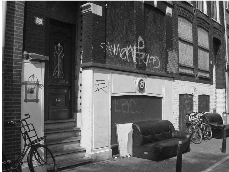
2.2 Squatted building alongside a canal in the Jordaan neighborhood, 2006