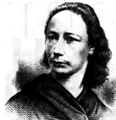
Louise Michel, drawn from life, 1880.

"Yes, monsieur. My friend X-recently proposed marrying one of