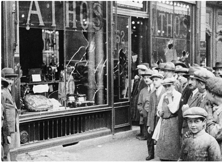
On August 23 and 24, 1927, French sympathizers smashed shop windows and wrecked places of business to vent their rage after the executions of Nicola Sacco and Bartolomeo Vanzetti. In Paris many demonstrators were injured in a clash with the police. This picture shows damage done by rioters in Cherbourg, France.