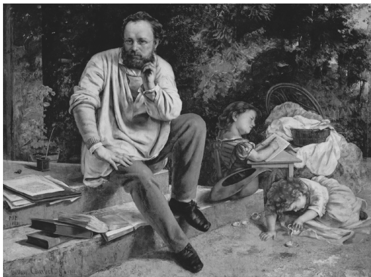
Pierre-Joseph Proudhon and his Children by Gustave Courbet Painting in the Petit Palais, Paris