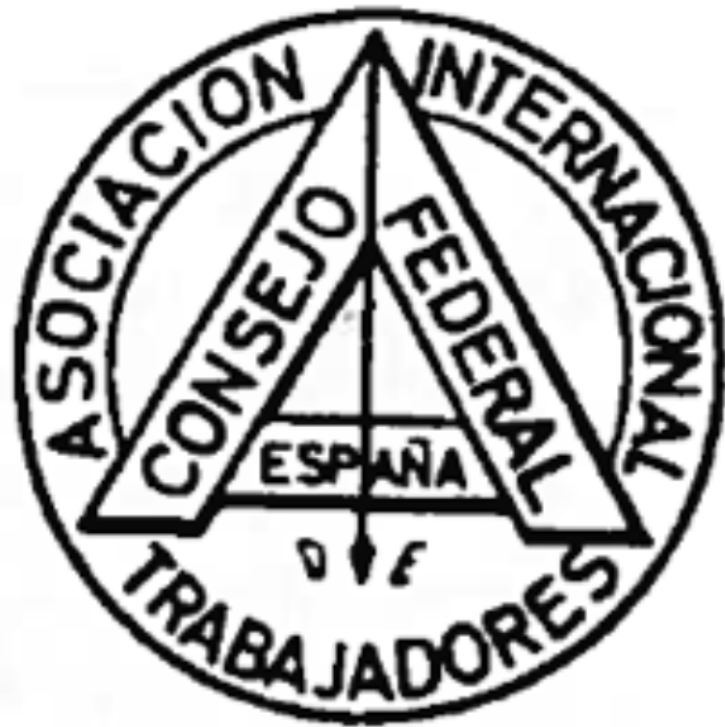
Fig 3. The seal of the Consejo Federal de España de la A.I.T. , circa 1870, by Vilallonga (own work, based on AIT.jpg) [CC BY-SA 2.5 ( https://creativecommons.org/licenses/by-sa/2.5 )], via Wikimedia Commons, https://commons.wikimedia.org/wiki/File:FRE-AIT.svg

with Hegel in conceiving consciousness as inextricable from material social processes, rather than as a first premise, however the material and the ideal remain indissoluble, his logic is dialectical, and the eschatology of his historical dialectic can be traced back to Joachim de Fiore as much as Hegel's can. While one of the main defining attributes of anarchism is its anti-Marxism, many Hermetic features of Marxist thought remain preserved (as abstract content) as well as transcended within anarchism's concrete form. 70