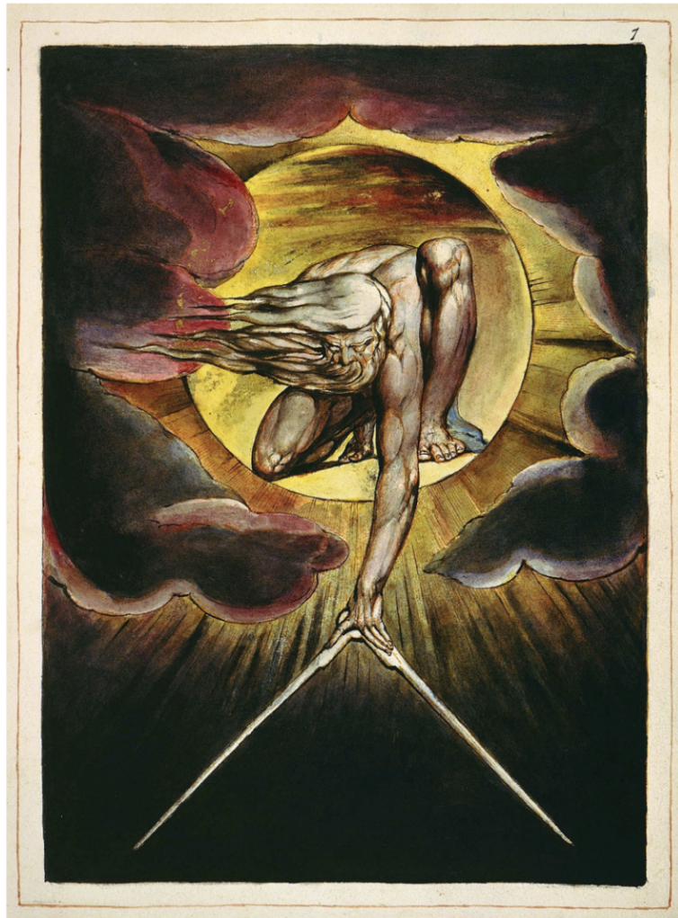
Fig 2. The compass is associated with power (in a geometrically gendered arrangement) by William Blake in Europe: A Prophecy (1794) – ‘When he sets a compass upon the face of the deep’ (Proverbs 8: 27)