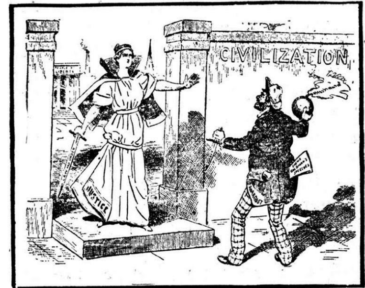
PUT THEM OUT AND KEEP THEM OUT — New York Tribune

And if the reader takes nothing else away from this article, at least take this: you are far, far, FAR more likely to find a self-described anarchist at your city's local chapter of Food Not Bombs, working at your town's food banks and soup kitchens, organizing unions at crony corporations in your county, or organizing any number of ventures to improve your community than you are to find them out in the streets with a cartoon-ish bomb (or a very real Molotov cocktail) committing acts of violence against innocent people.