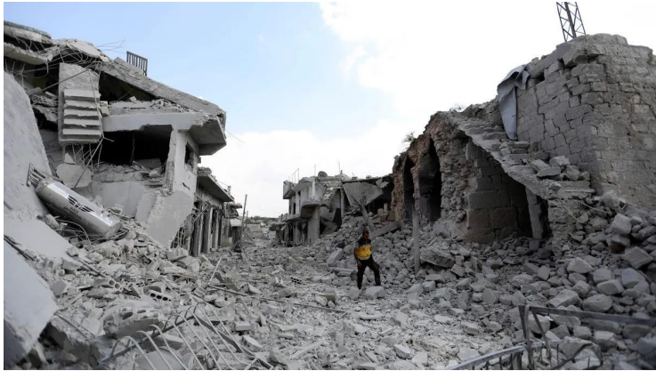
Immediately after the earthquake, the al-Assad regime resumed bombing parts of Syria that remain beyond its control.

more attempts by the war criminal Bashar al-Asad to regain international legitimacy.