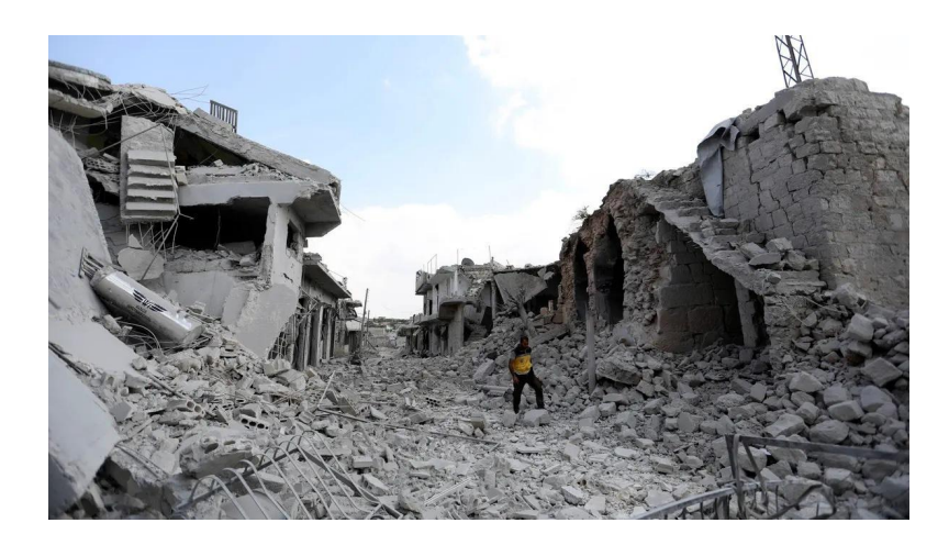
Immediately after the earthquake, the al-Assad regime resumed bombing parts of Syria that remain beyond its control.

we should do is to name those who are accountable: the treacherous contractors and employers; the media, the state, and its military; the mainstream parliamentary opposition bloc, which has tempered itself to moderation, while lionizing the state and its ideological apparatus; the bourgeoisie, its crocodile tears and uninvolved gestures of charity; the neofascist militants who police and penalize survivors, refugees, and internally displaced persons in the name of "public order"; all who have sacrificed the safety and dignity of citizens for the sake of greed and a fetish for profit.