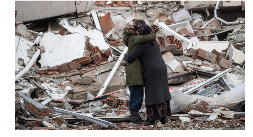
The consequences of the earthquake in Idlib.