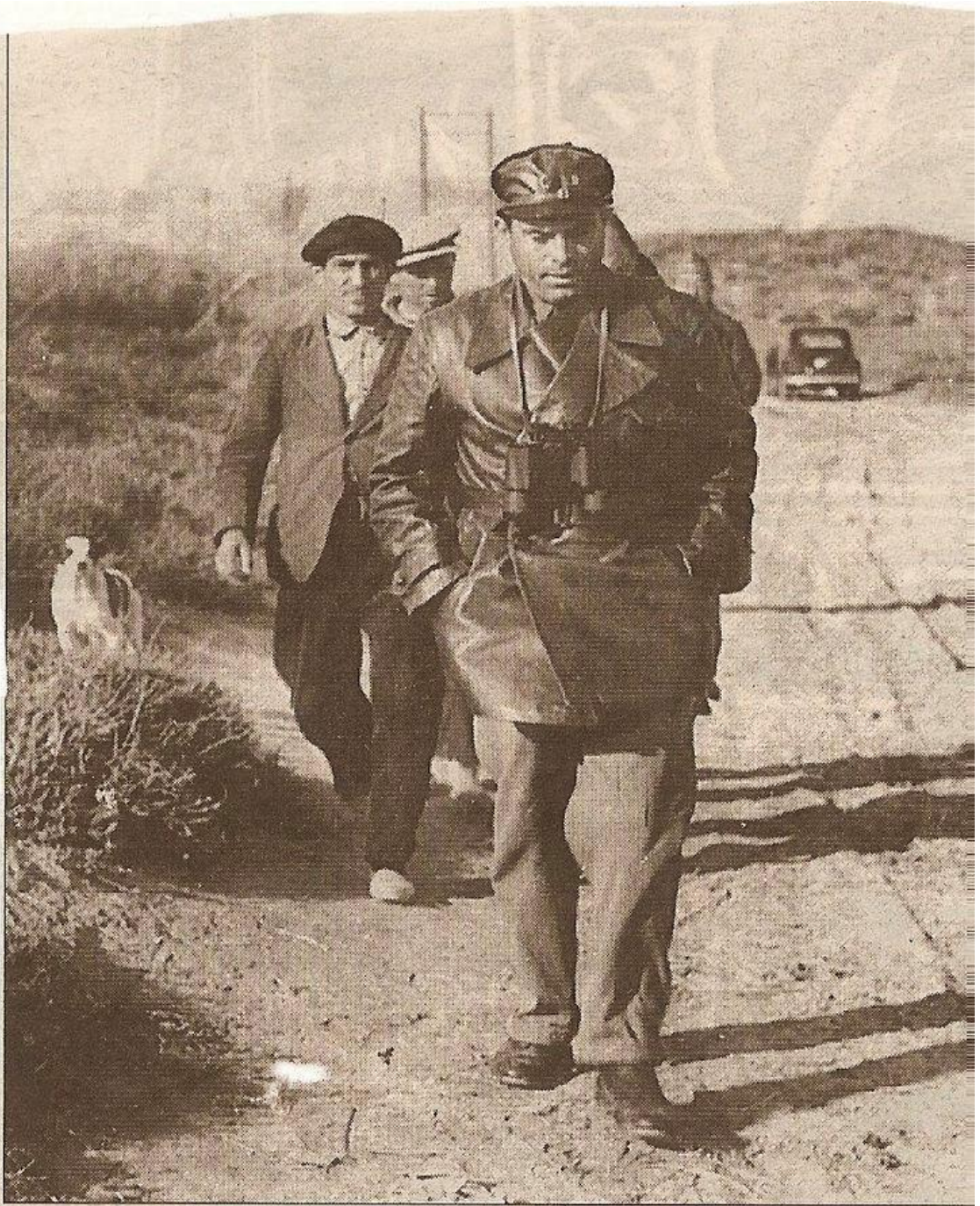
Buenaventura Durruti, en el frente de Aragón.