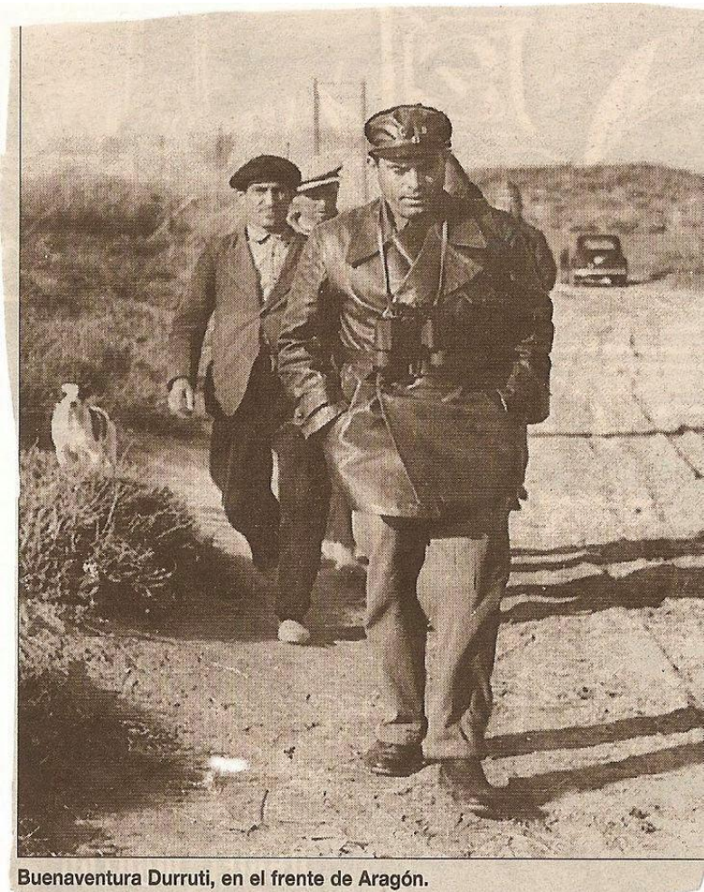
Buenaventura Durruti, en el frente de Aragón.

hoarse whisper. And he added: 'That world is growing in this minute.' 1