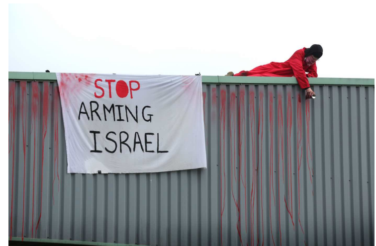
A photograph from Palestine Action showing a protester occupying the roof of Howmet Fastening Systems in Leicester, United Kingdom. 6 Howmet makes components for Israeli F-35s.

This scorched-earth approach to war can be seen in Israel's air strikes in Gaza. These attacks on civilian infrastructure appear to represent an intentional strategy in which civilians and the resources they depend on become the primary targets of war. This suggests that the strategy of disproportionate force Israel developed in Lebanon is implicated in the devastating loss of life and life-giving infrastructure in Palestine.