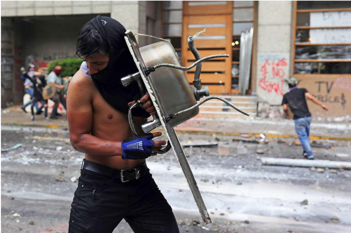
A dishwasher uses a sink as a shield during clashes with police in Santiago, Chile on November 8, 2019. Let's turn the roles that capitalism forces upon us into weapons against the system itself.