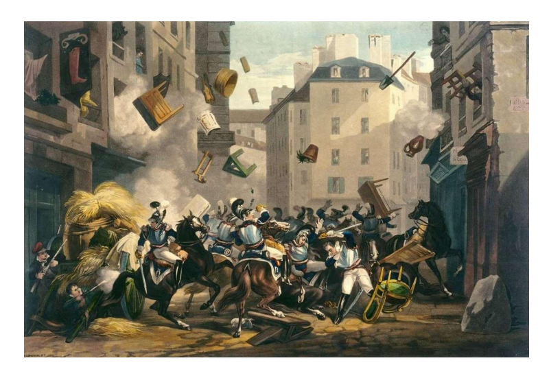
From 1830 to today, we must weaponize the ordinary conditions of our daily lives if we are to defend ourselves against our oppressors.

At the time, I cared about very little besides hanging out with my friends, riding bikes, reading fantasy novels, and drinking beer. I needed money to pay my rent, pay for food and beer, pay for gas and car insurance, and so on, but it was possible to squeeze by with a terrible minimum wage job.