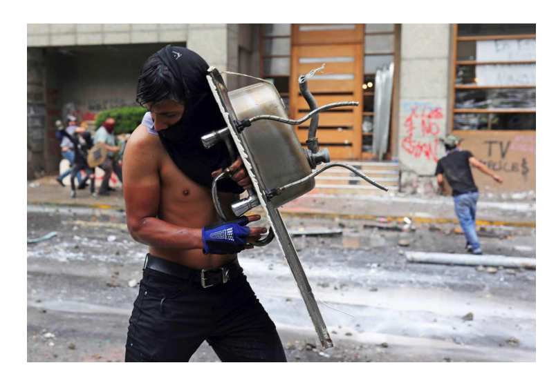
A dishwasher uses a sink as a shield during clashes with police in Santiago, Chile on November 8, 2019. Let's turn the roles that capitalism forces upon us into weapons against the system itself.

At the time this story took place, most of us were service industry workers: cooks, servers, bakers, bartenders, cab drivers, baristas, home care workers, grocery store clerks, things like that. We often found ourselves on the lower rungs of the job ladder. We would work the tedious and unpleasant jobs that offered us some degree of flexibility and the freedom to live our weird lives.