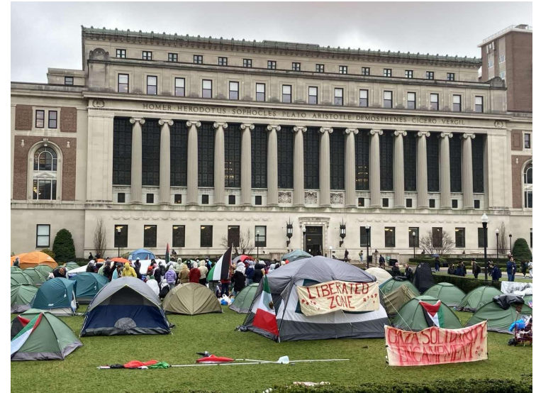
Columbia campus on the morning of Thursday, April 18.

Beginning last fall, after large and contentious pro-Palestine demonstrations and Zionist counter-demonstrations took place on campus, the university began selectively restricting access to campus by locking nearly all the access gates and requiring people to swipe an active ID card at a reader staffed by private security guards. This has been an immensely unpopular move across the board, on account of both the inconvenience it creates and the Orwellian police state vibe it imposes.