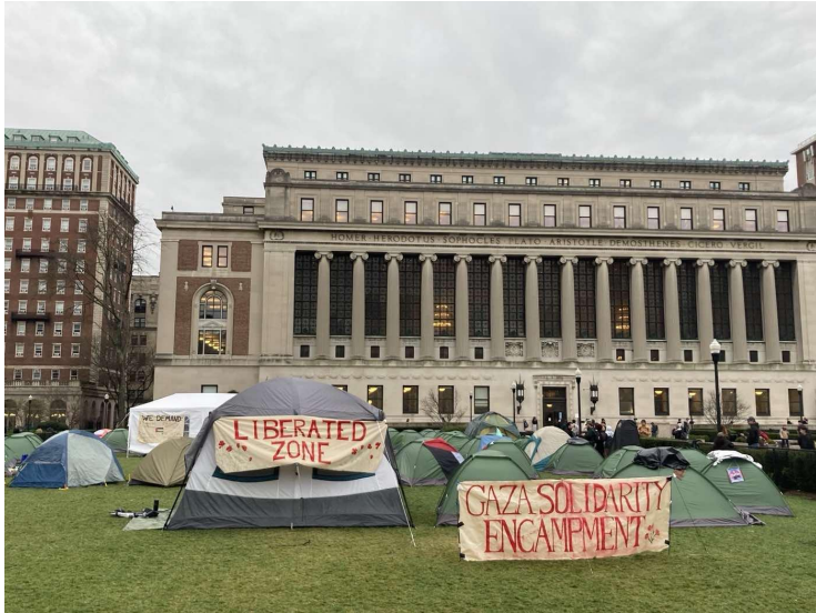
The East Lawn on Columbia University campus on Wednesday, April 17.

flags, sings. At one moment, dozens lift up their phones with their flashlight apps blazing like lighters and sway in a circle. Despite the constant cheers and ruckus, dozens have already bunked down in sleeping bags and under piles of blankets. Others wander, chatting excitedly or gathering up trash.