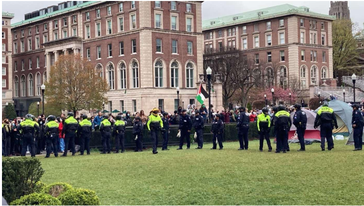
Police seizing the East Lawn on Thursday, April 18.

campment on Wednesday is the restriction of physical access to the campus. Columbia's Morningside campus itself is relatively small, just four short blocks by one long block; the perimeter is comprised of walls and iron gates. An archway over Amsterdam Avenue connects to additional campus buildings and the law school in another linked area of two square blocks. Barnard College, Columbia's sibling institution on the other side of Broadway, is similarly compact, forming a rectangle one block long by four blocks wide, fenced in with even fewer entrances and exits, though those with Columbia and Barnard IDs can freely enter either campus.