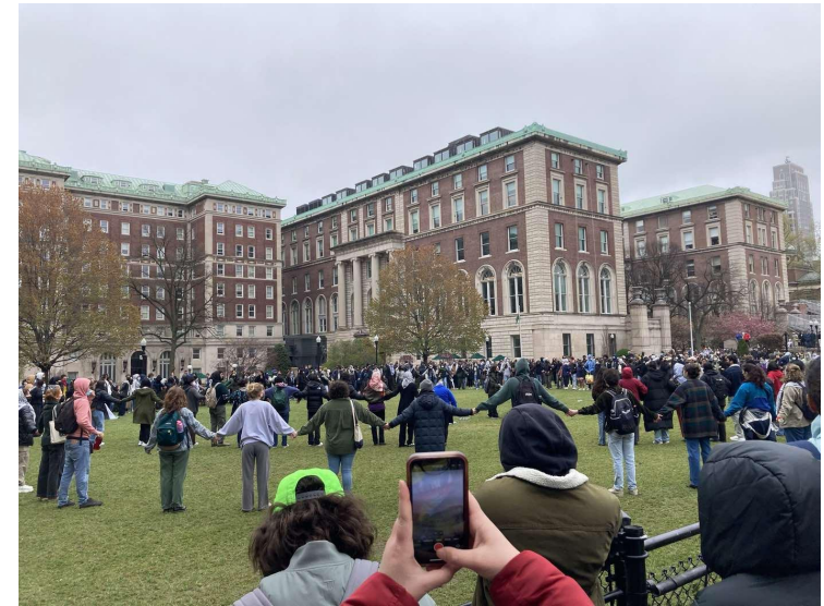
The occupation of the West Lawn unfolds.

people into the movement, creating a new cross-pollination between campus life and protest activity. To the extent to which the administration cannot distinguish between the student body as a whole and the protesters, everyone involved is safer.