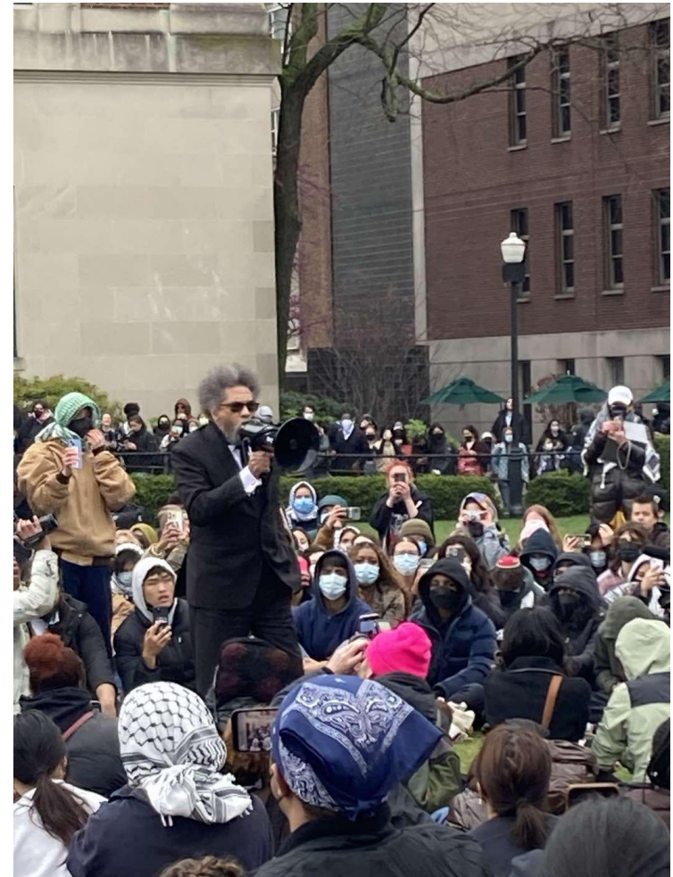
Cornell West speaking on the West Lawn.

As the deadline approached and organizers reached out to their networks, scores of messages circulated the campus. The trickle of supporters from nearby dorms and libraries became a flood. By 9 pm, a massive picket encircled the entire encamp-