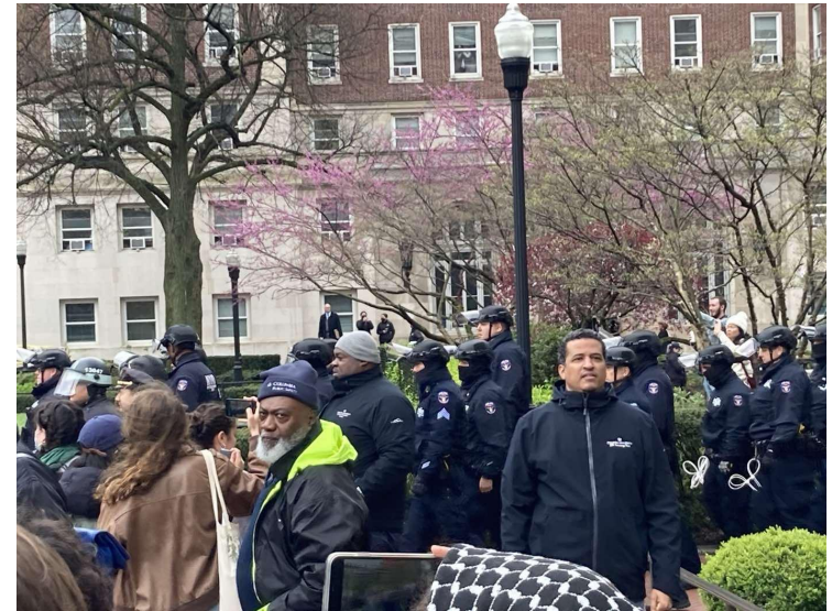
Police enter Columbia campus on Thursday, April 18.

began blaring an order to disperse on threat of arrest for trespassing.