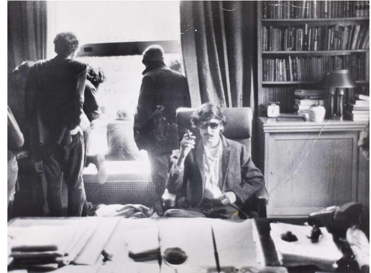
A student activist occupying the office of the president of Columbia University, smoking one of his cigars, during a six-day campus uprising and strike in 1968.

Click here 2 for a printable pdf of the handout.