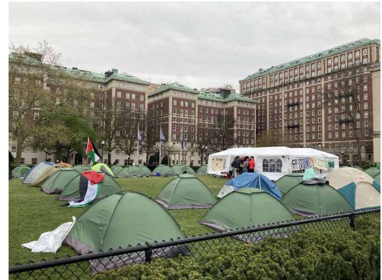
The East Lawn on Columbia University campus on Wednesday, April 17.

In the end, the size and spirit of the camp proved too much to evict that night. At 10:44 pm, organizers got word that the administration had been forced to abandon plans for a sweep. The camp survived the night.