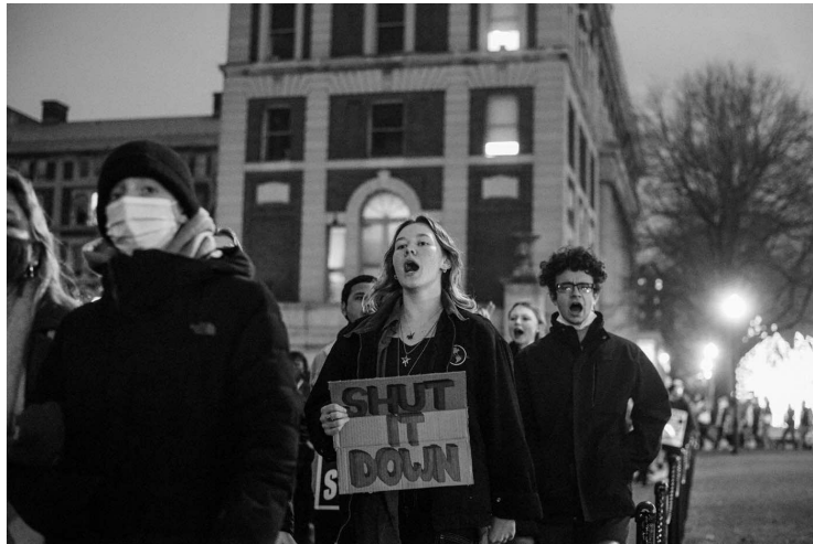
Participants in Columbia's graduate worker union demonstrating during the previous round of protest activity at Columbia.

The groups that joined the coalition reflected a wide range of political perspectives and ethnic and religious backgrounds, tapping into a diverse range of the campus's social networks. These would be instrumental in the struggle to come.