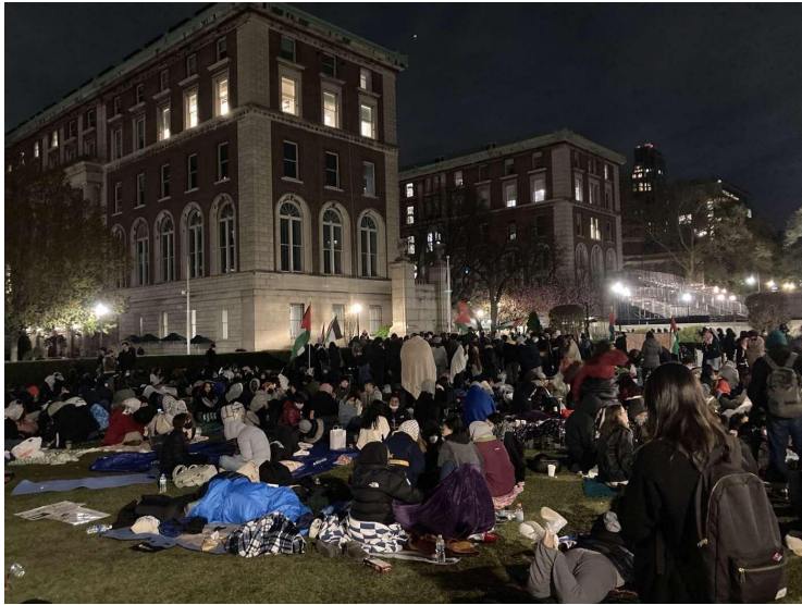
The encampment on the night following April 18.

constant stream of information. I had to make it uptown. I found a friend to join me.