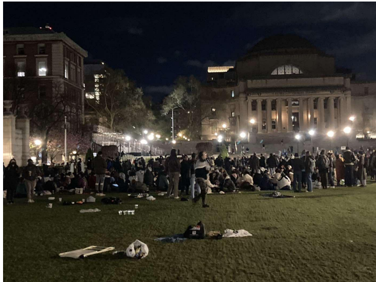
The encampment on the night of April 18.

“Disclose, divest—we will not stop, we will not rest!” Rebels in kaffiyehs dance enthusiastically, others bang on pots. In a thick sleeping bag next to me, the student who got out of jail last night sleeps angelically.