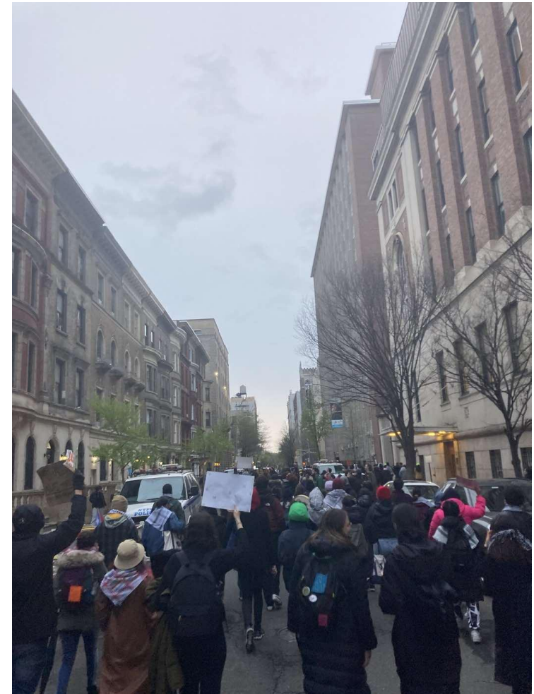
A march outside Columbia campus.

The bold decision to occupy the West Lawn exemplifies this. It was significant, first, because holding physical space has proved to be a critical element in focusing the energy and attention of the movement on campus. Countless demonstrations have taken place at Columbia since October, but however energetic and well-attended they were, all of them dispersed within a few hours, conceding both the physical territory and the initiative to the administration, which ratcheted up repression by targeting the participants after the fact. By contrast, holding territory has compelled all sides to confront the fact of the ongoing genocide; it has drawn many more