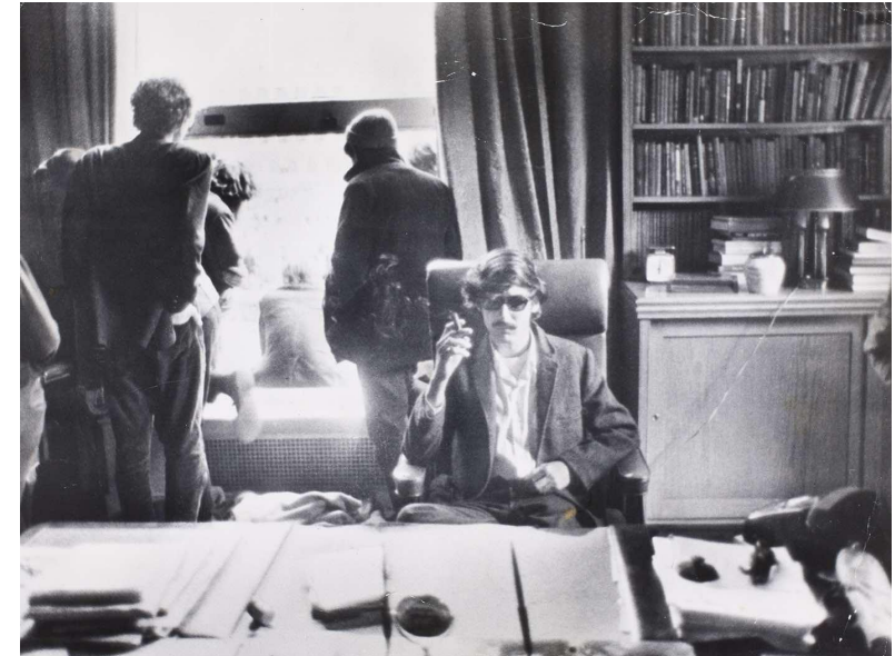
A student activist occupying the office of the president of Columbia University, smoking one of his cigars, during a six-day campus uprising and strike in 1968.

This is why the most important boundary to overcome is the distinction between inside and outside . As long as a strict separation remains between students and non-students, between included and excluded , those who wish to act in protest will have to choose between a venue in which any action will be seen as possessing social legitimacy but must be undertaken by highly surveilled students who consider themselves to have a lot to lose, and a space outside the walls where more forms of action are possible but less is at stake in terms of perceived legitimacy and the power to disrupt. The solution is to tear down the walls.