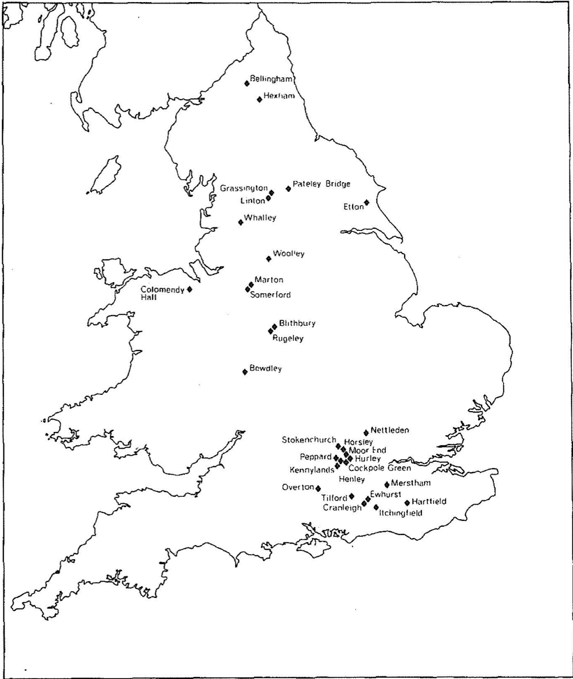
National Camps Corporation sites, 1939