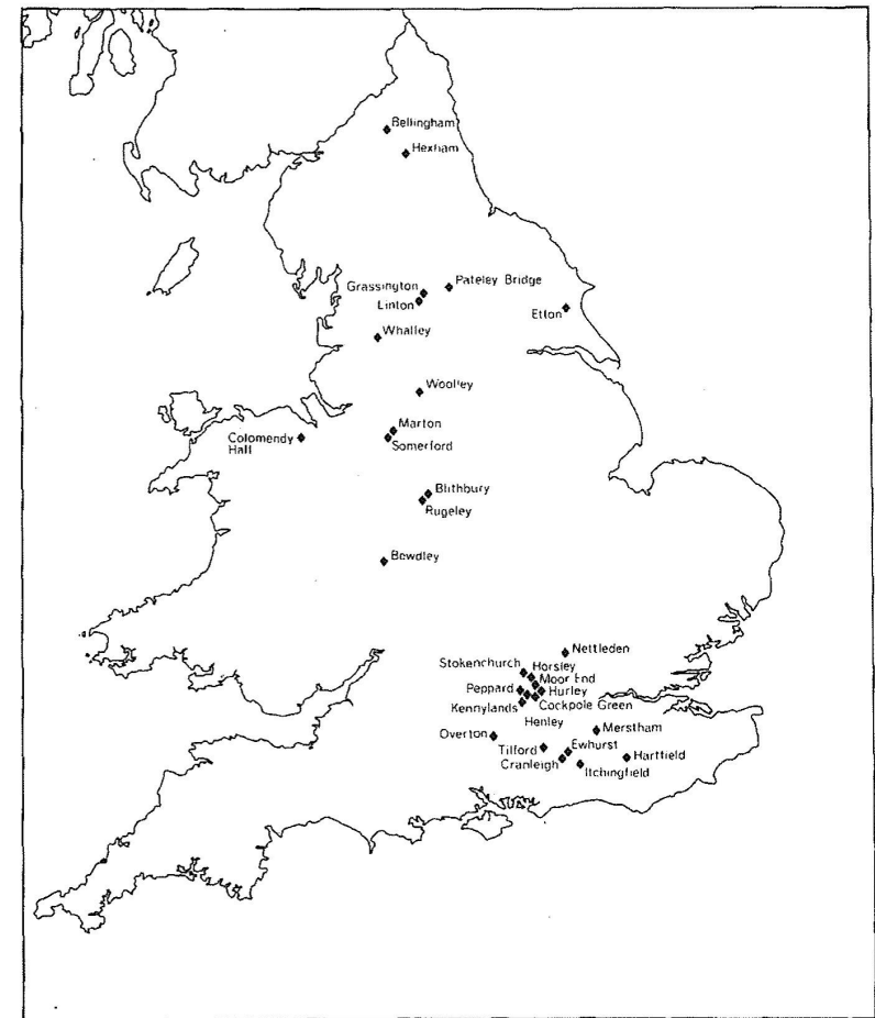
National Camps Corporation sites, 1939

It was Morris's contemporary and friend Peter Kropotkin who added some thoroughly modern contributions to his comments on industrial production. In his study of Fields, Factories and Workshops of 1899, he gathered a mass of statistical evidence to show that ideologists of both right and left had exaggerated the scale of factory production. Most of our ordinary daily needs were produced in a small-workshop economy. And he anticipated the changes in sources of motive power that in the 20 th and 21 st