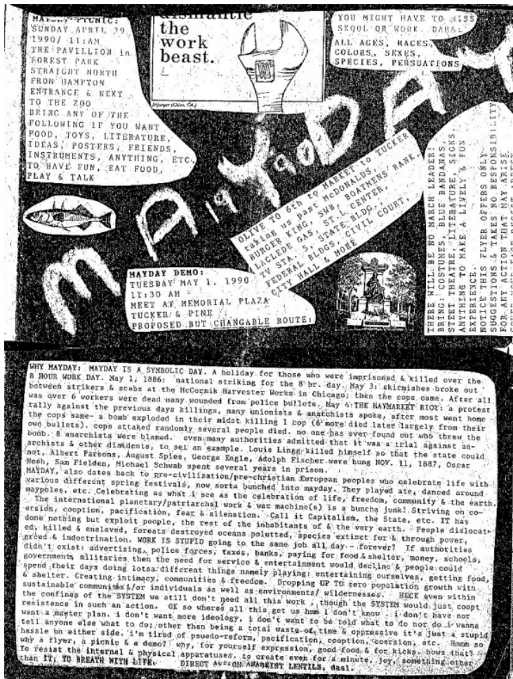
Figure 9.1 May Day flyer (St. Louis, 1990).