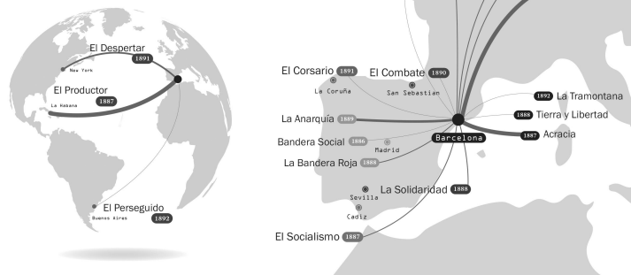
Figure 10.1 Map showing the number of references in El Productor (Barcelona), by journal, 1887-93.