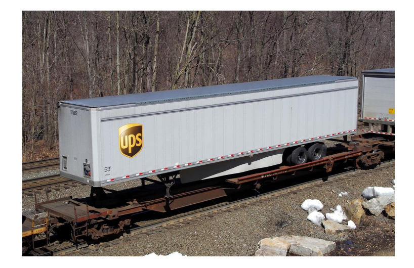
IM car with UPS pig with wings.