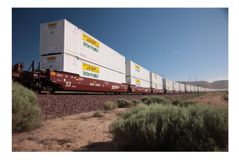
53 ft smooth cars from an IM with JB Hunt double stack cans.

Use GPS to track your location. Stay hidden while going through railyards.