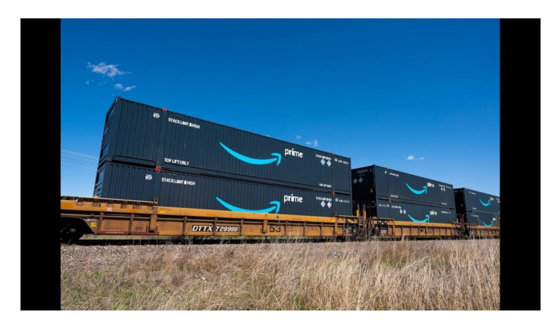
53 ft ribbed car from an IM with Amazon Prime double stack cans.