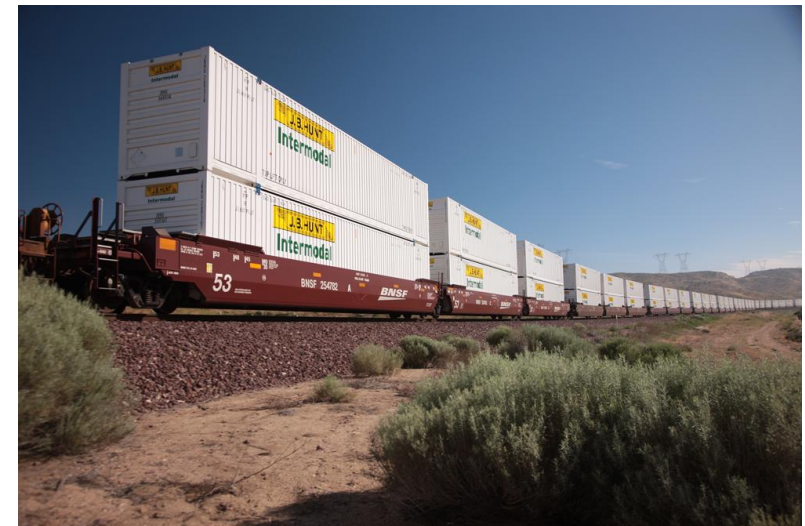
53 ft smooth cars from an IM with JB Hunt double stack cans.