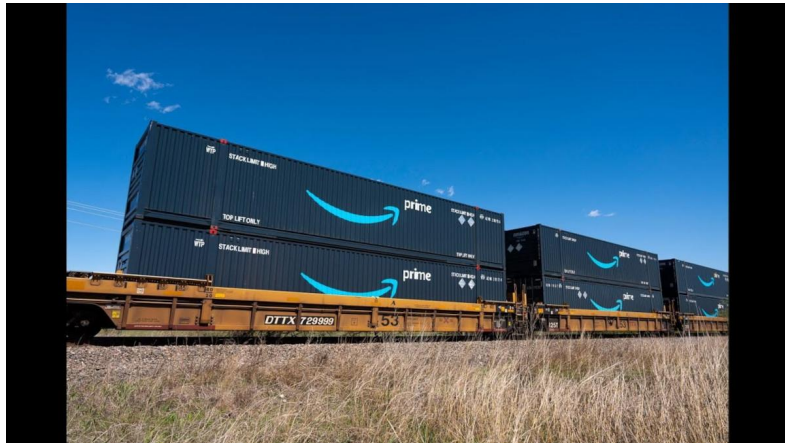
53 ft ribbed car from an IM with Amazon Prime double stack cans.

acteristics of your trains that are different from the characteristics of the other decoy trains. Some characteristics include: