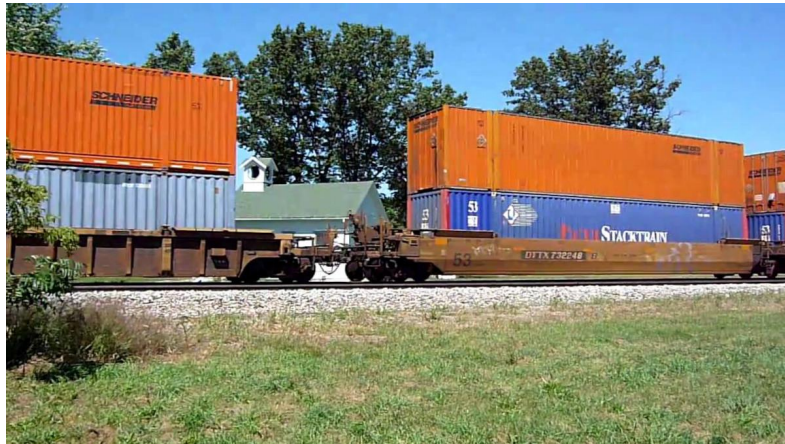
Two 53 ft double stack IM cars. Ribbed car on the left much more likely to be rideable than smooth car on the right.

which means it is picking up or dropping off cargo, or refueling. The crew change guide should specify the crew change spots and might specify whether work/refueling is done.