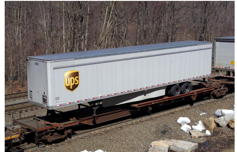
IM car with UPS pig with wings.