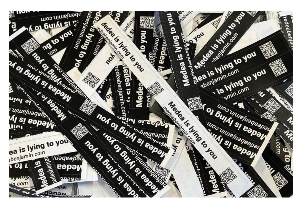
Now, imagine 500 of these and a lot of larger pieces of paper.