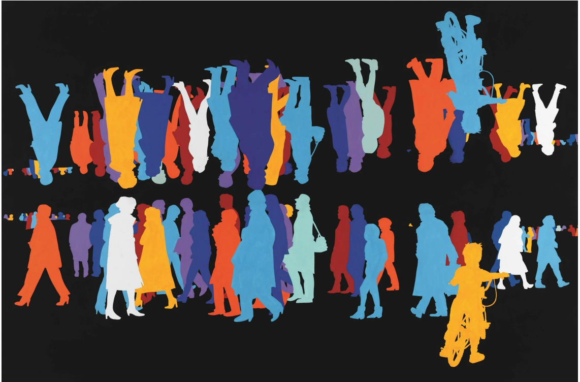
Art by Gerard Fromanger