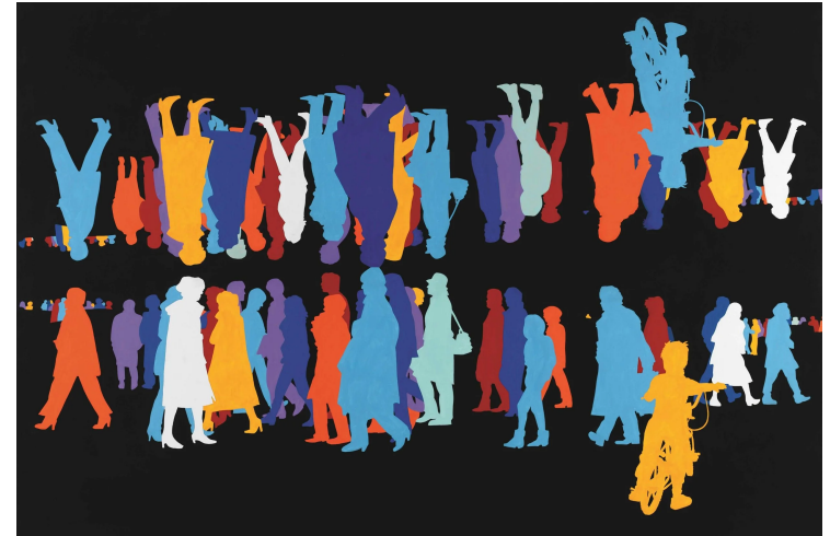
Art by Gerard Fromanger