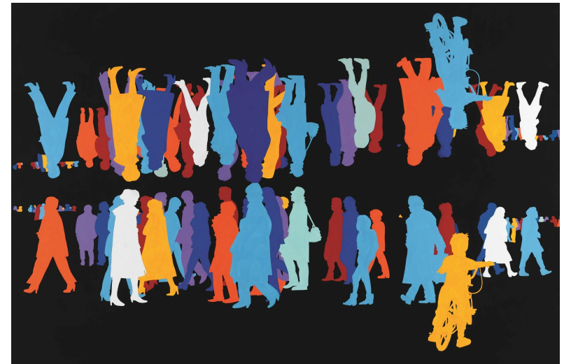
Art by Gerard Fromanger