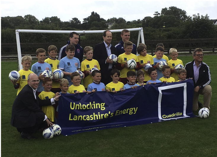
Fig. 3. Cuadrilla's sponsorship (Cuadrilla, 2016).

In terms of community disputes and grievances, are there instances where community leaders or people of influence in the community resolve issues, rather than the local authority or equivalent body?