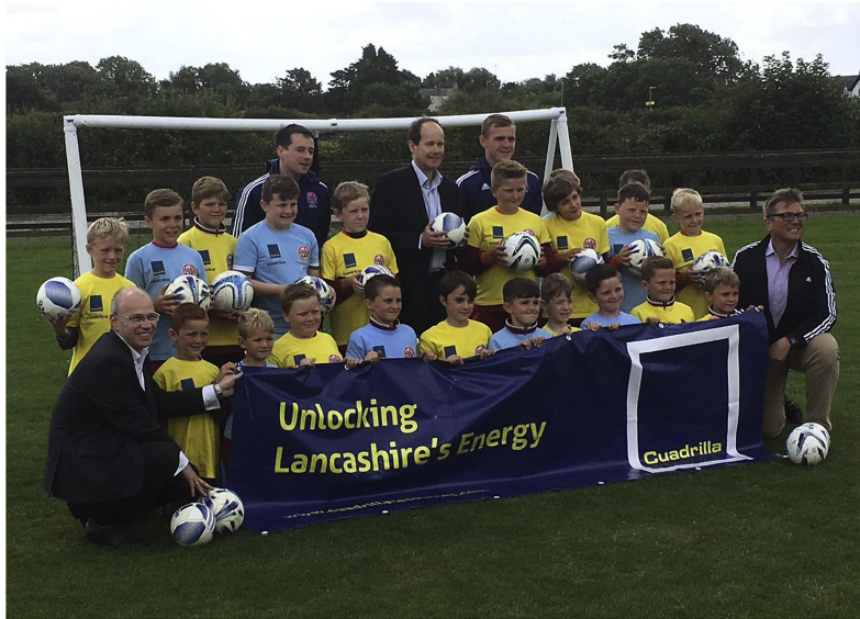
Fig. 3. Cuadrilla's sponsorship (Cuadrilla, 2016).

In terms of community disputes and grievances, are there instances where community leaders or people of influence in the community resolve issues, rather than the local authority or equivalent body?