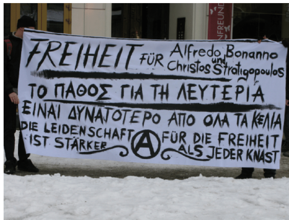
Figure 3: “Freedom for Alfredo Bonanno & Christos Stratigopoulos. The passion for freedom is stronger than any prison.” Both arrested for bank robbery in Greece, Bonanno was age 73 in 2010.

and Bakunin’s anarcho-communist emphasis on collective struggle and controlling productive infrastructures to institute egalitarian, self-organized and peasant-led movements (see also Roman-Alcalá 2020). Meanwhile taking up Stirner’s iconoclastic insurrectionary proposal along with the legacy of Illegalists, 12 Renzo Novatore and Luigi Galleani focused on free-will, individual and direct action. This also includes a rejection of workerism, the political theory that emphasizes, if not glorifies, the working class and its morality. Formalizing an idea and practice arising from 1970s revolutionary Italy (see Weir 1990 [1979]), insurrectionary anarchism began to take shape with Alfredo Bonanno’s (1998a [1977]) influential text, Armed Joy . At the time of its publication, it was banned and copies were burned, and Bonanno was sentenced to eighteen months in prison for authoring the text. Apparently, the text’s proposed paradigm shift for militant struggle threatened the Italian state. Anarchism, then, is defined as a tension. “Anarchism is not a concept that can be locked up in a word like a gravestone. It is not a political theory. It is a way of conceiving life” (Bonanno 1998b [1996]: 4), “young or old as we may be, old people or children, it is not something definitive: it is a stake we must play day after day.”